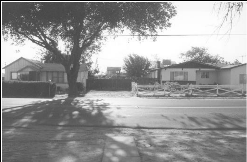
Photo C. View of Uses to North. Note the inconsistency of theme with the site.