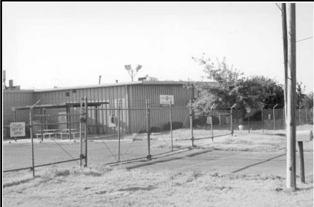
Photo A. Overall View of Site. Note the landscaping along the building.