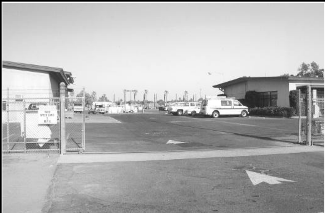
Photo D. View of Use to East. Note that this use is similar in theme with the proposed use.