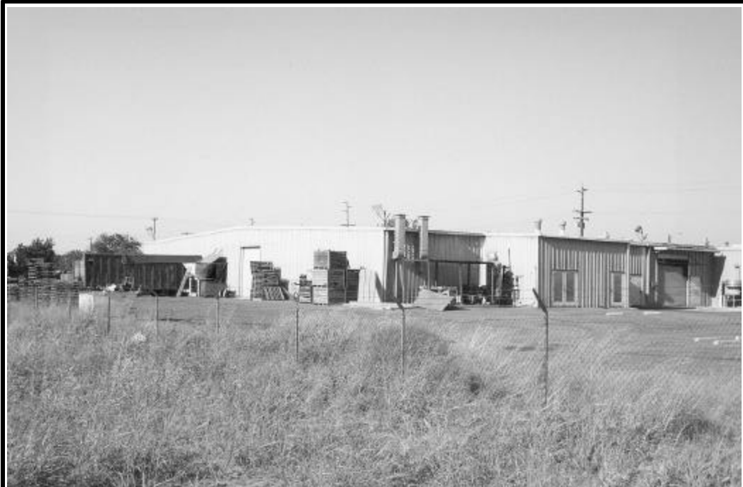
Photo B. Rear View of Site. Note the remaining equipment from previous use.