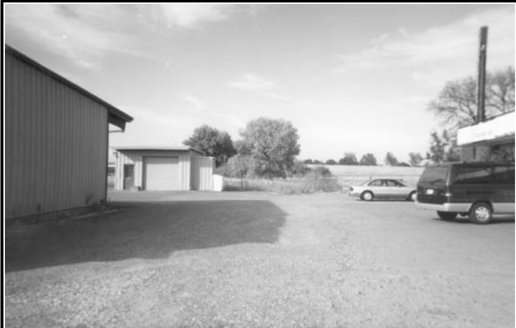
Photo D. View of East Side of Proposed ILA Site from Southeast Corner Facing North. Note small building is on north end of site and the commercial business east of the site.