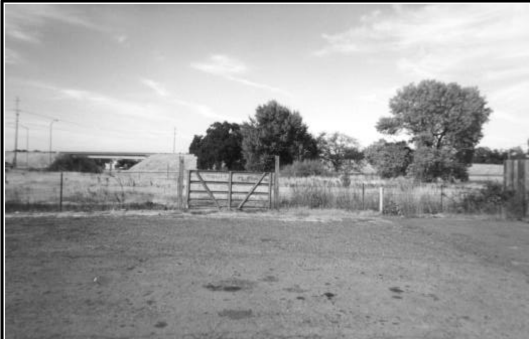
Photo C. View from On-Site Facing North. Parcel north of the site is vacant. Note Highway 44 overpass (over Deschutes Road) and Highway 44 on-ramp (eastbound).