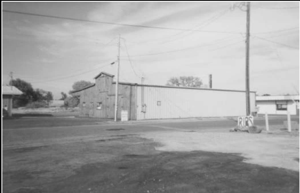
Photo A. View of Proposed ILA Site from Palo Cedro Inn (Restaurant) Facing Northeast (Approximately 110 Feet from Site). Note commercial business east and west of site.