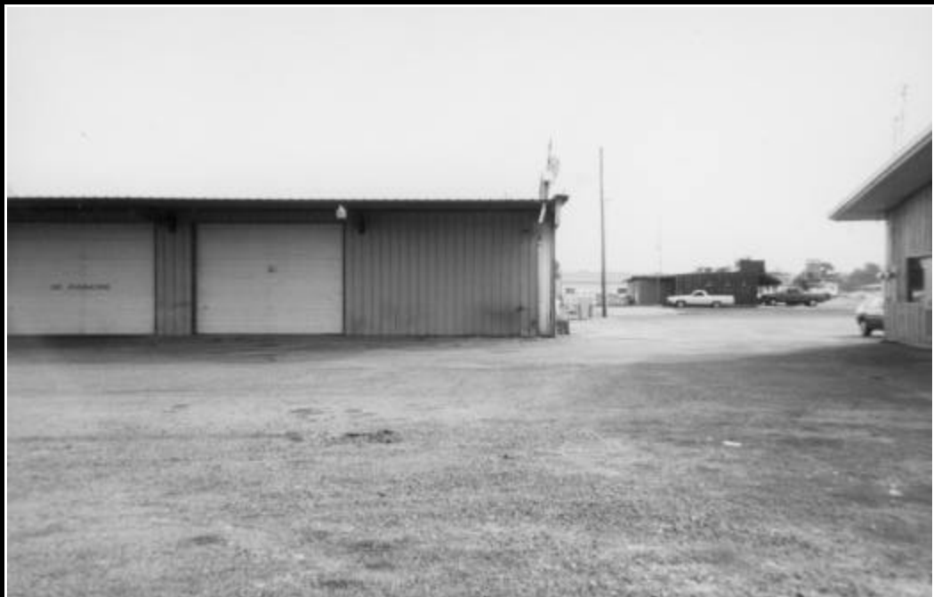
Photo B. View of Proposed ILA Site from Northwest Corner of Site Facing South. Note Palo Cedro Inn across Palo Way and The Cedar Tree Restaurant west of site (approximately 30 feet from site).