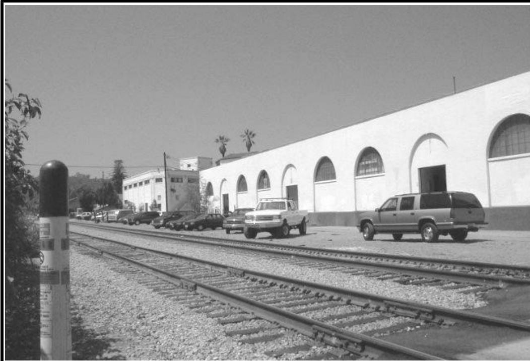
Photo C. View of South Face of Building and Railroad with Access to Anacapa Street.