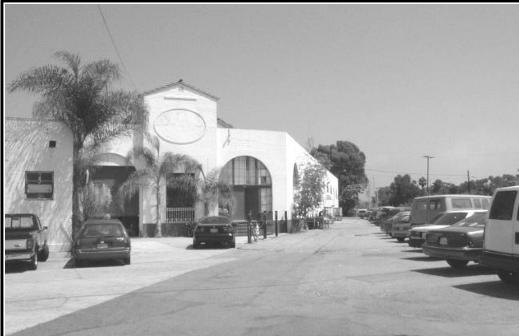
Photo B. West Face (Front) of Building and Alley Adjacent to Railroad with Access to Anacapa Street.