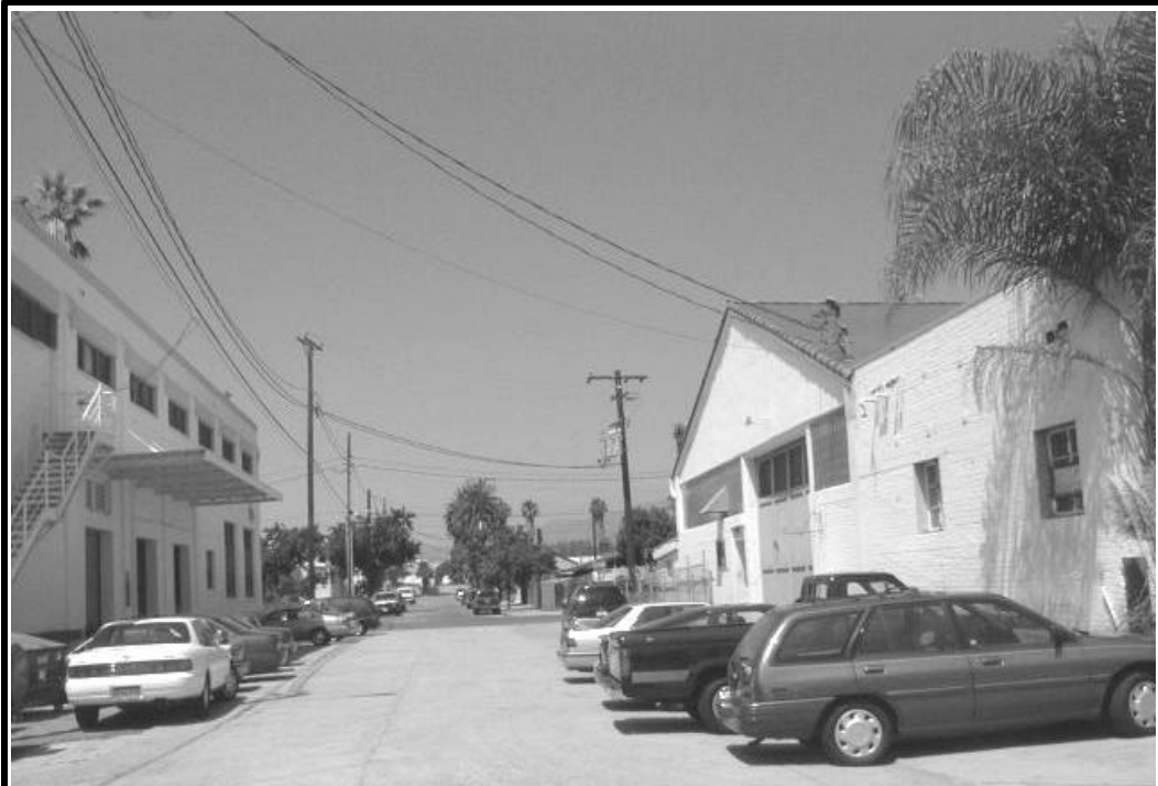
Photo D. View of Helena Avenue Looking Northwest.