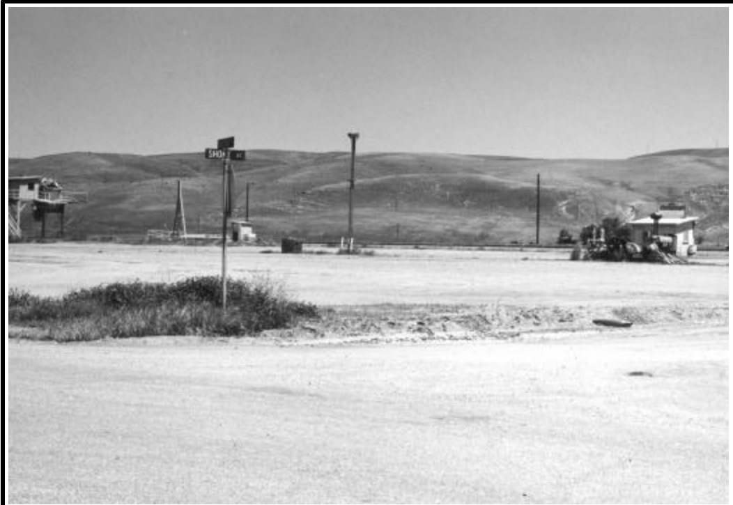
Photo C. View of Site from the South. Photo taken from south of site facing north. Note the rolling hills in the background.