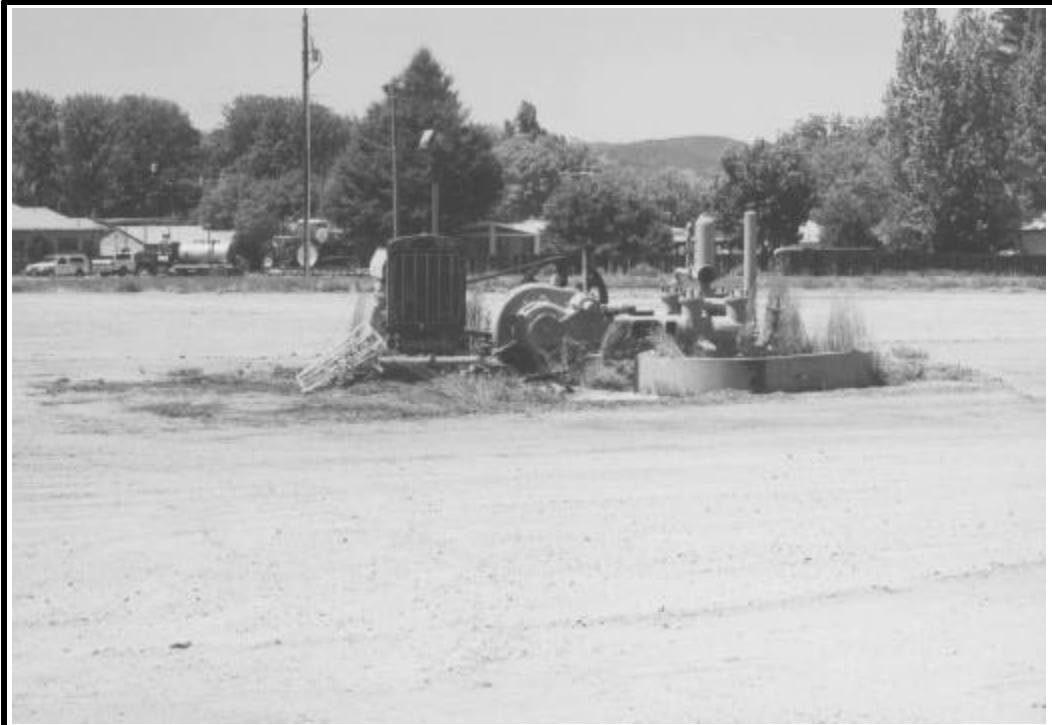
Photo D. On-Site Water Pump and Equipment. Photo taken from eastern edge of site facing southwest. Note that the pump is no longer in use.