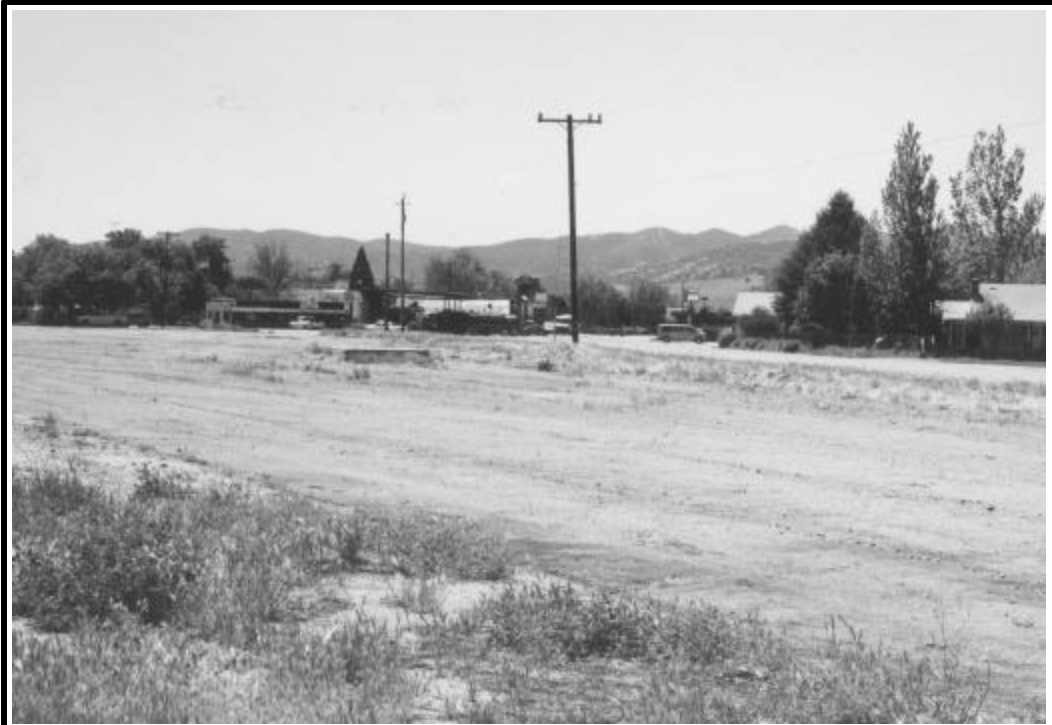
Photo A. Overall View of Site. Photo taken from northeast corner of site facing south. Note the overhead powerlines along Cattlemen Road and residential uses to southwest.