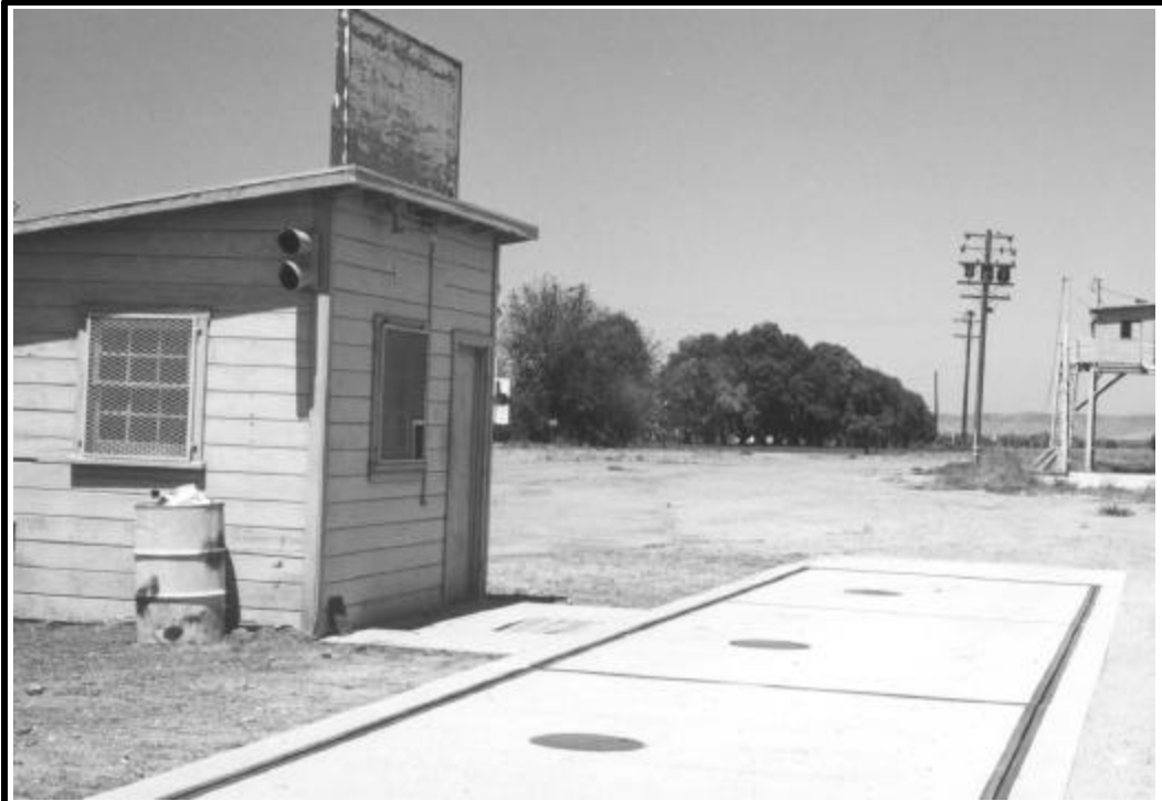
Photo B. Existing Structures On Site. Photo taken from eastern boundary facing northwest. Note the vacant building and truck scale in the foreground, and loading platform and overhead powerlines further northwest.