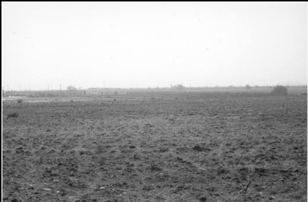
Photo D. View from Center of Site Looking South. The vacant buildings are located beyond Industrial Parkway to the south.