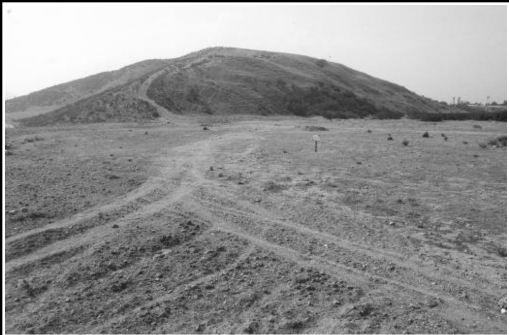
Photo A. Overall View of Site. Hill is located beyond the site.