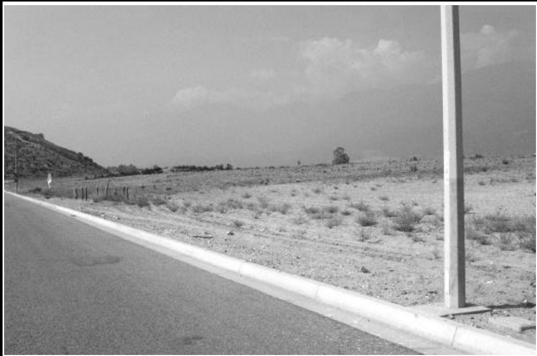
Photo C. View from Industrial Parkway South of the Site. Note the GTE manhole near the center of the site.