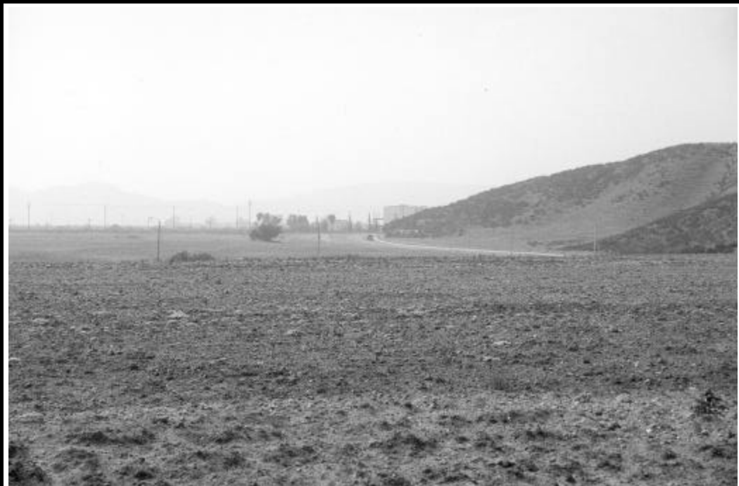
Photo B. View of Site from Northeast Corner. Note the running line is located along BNSFRR ROW approximately one-quarter mile from site (background).