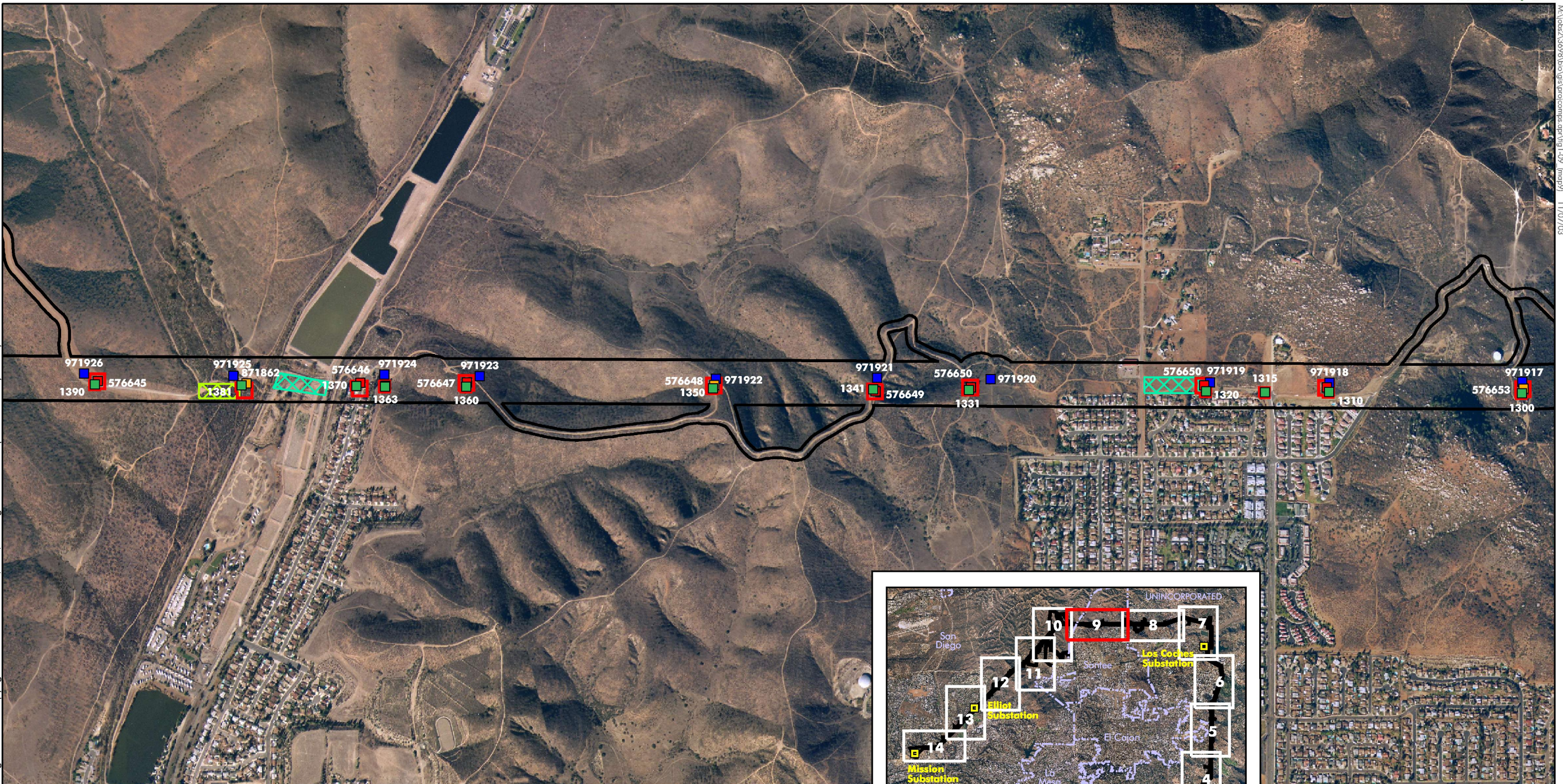
Image Source: Copyright 2001 AirPhotoUSA, LLC, All Rights Reserved (flown January 2001)