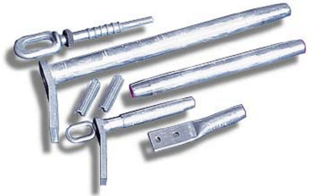
Figure 2: ACA Compression-Type Hardware

The compression-type hardware from ACA uses a modified two-part approach for separate gripping of the core and then an outer sleeve to grip the aluminum strands, as shown in Figure 2. This approach is similar to the approach used in ACSS, although modified to prevent crushing, notching, or bending of the core wires. The gripping method ensures the core remains straight, to evenly load the wires, and also ensures that the outer aluminum strands suffer no lag in loading relative to the core.