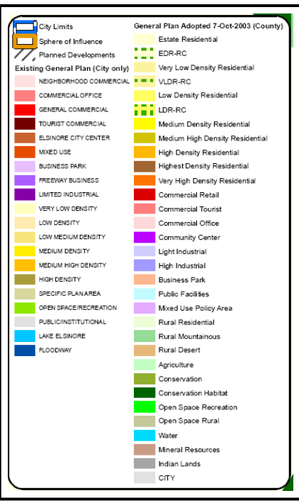
Figure 4.11.1-2. City of Lake Elsinore Existing General Plan