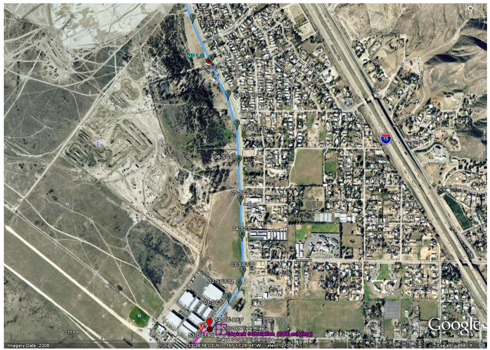
Figure 3.1.1-5: 115 kV Corridor Plan (5 of 7)