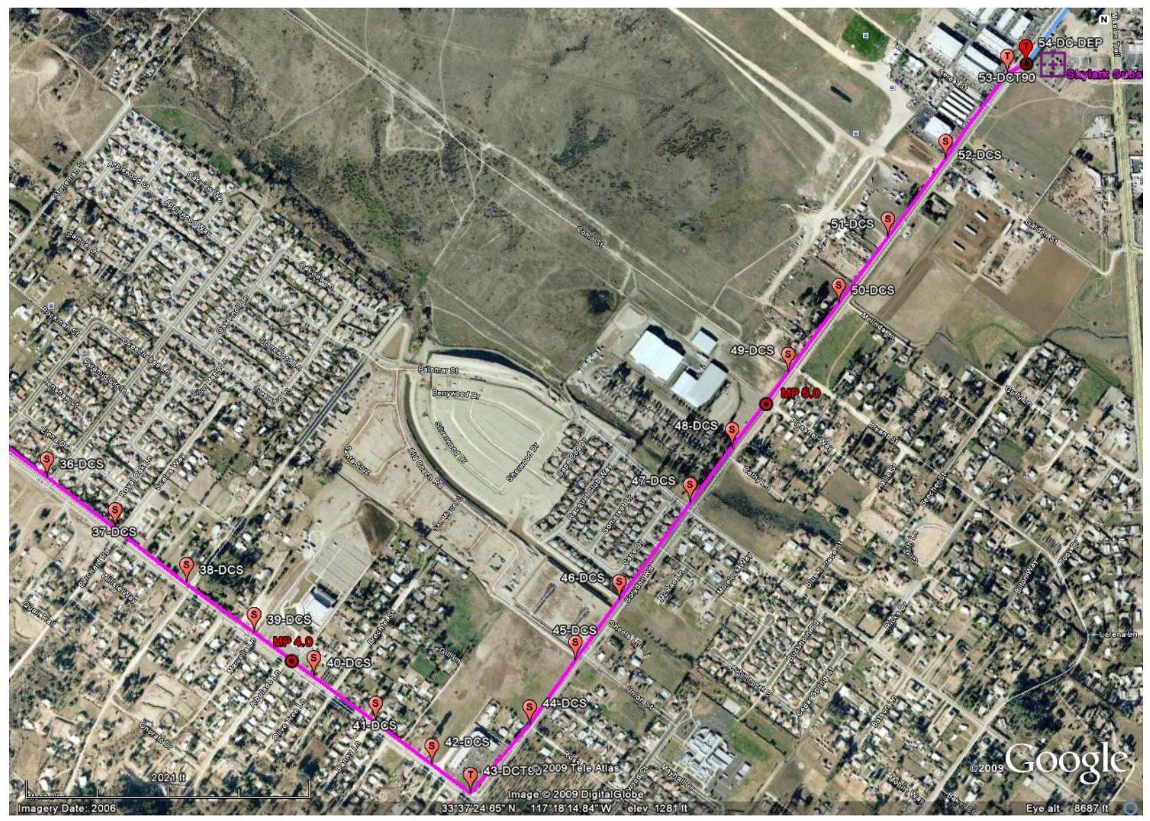
Figure 3.1.1-5: 115 kV Corridor Plan (4 of 7)