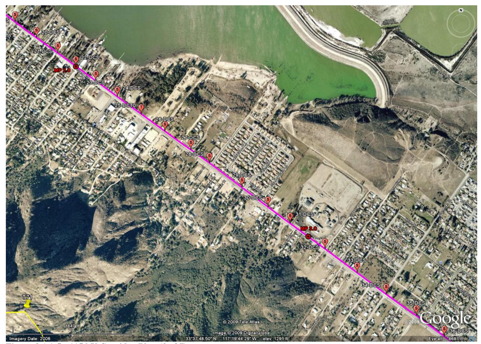
Figure 3.1.1-5: 115 kV Corridor Plan (3 of 7)