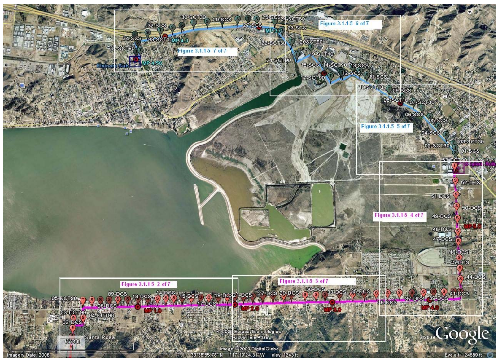
Figure 3.1.1-5: 115 kV Corridor Plan (1 of 7) Index