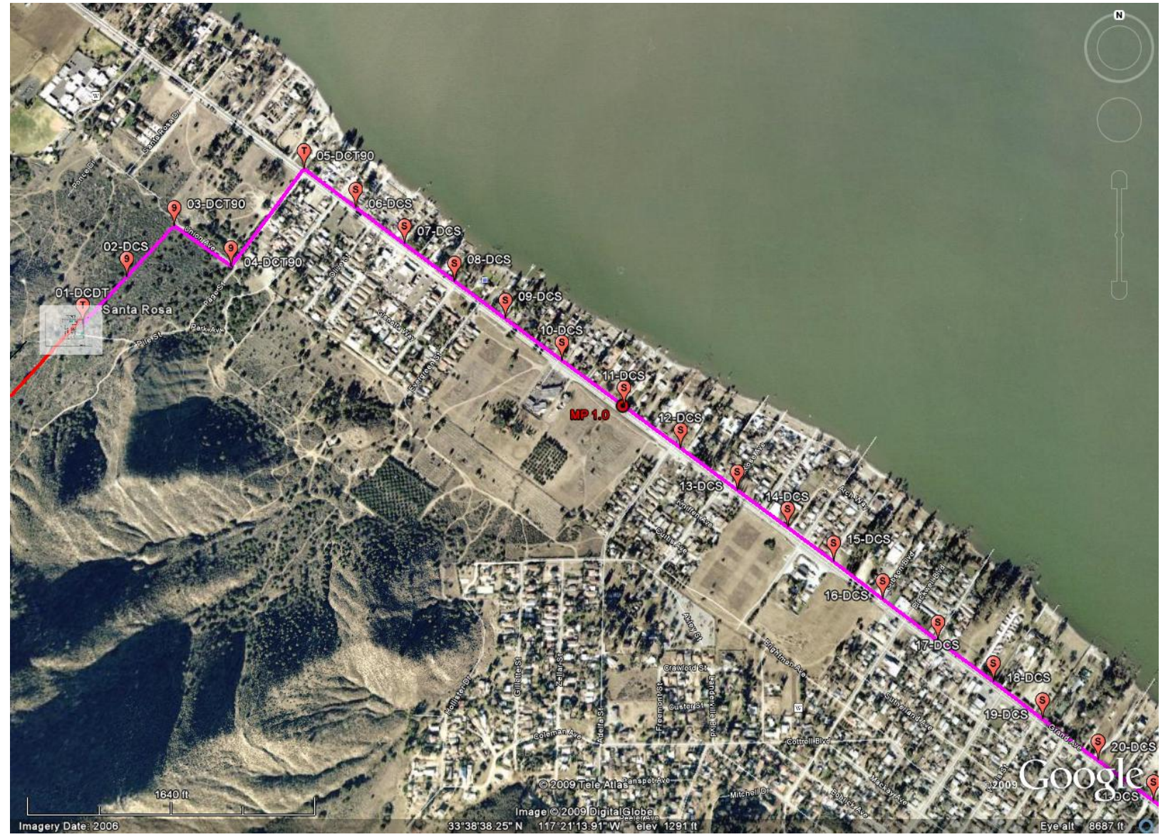
Figure 3.1.1-5: 115 kV Corridor Plan (2 of 7)