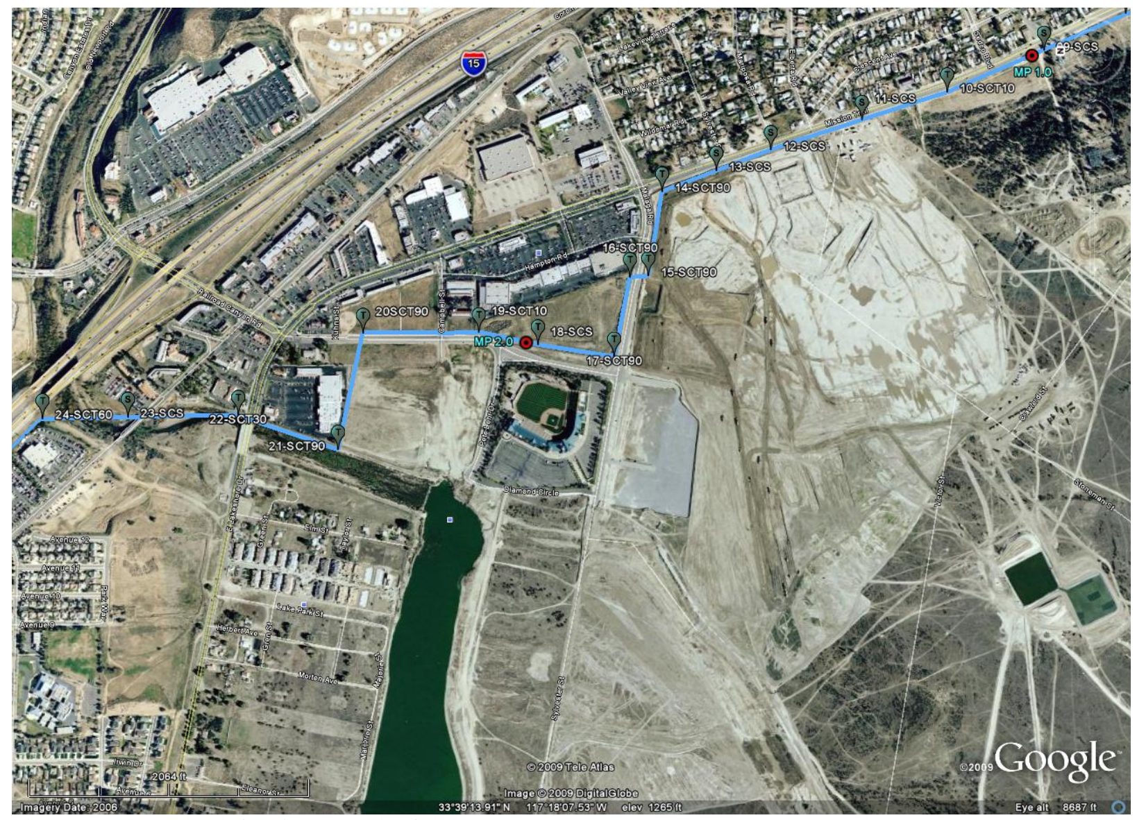
Figure 3.1.1-5: 115 kV Corridor Plan (6 of 7)