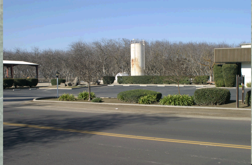
Key Observation Point 1