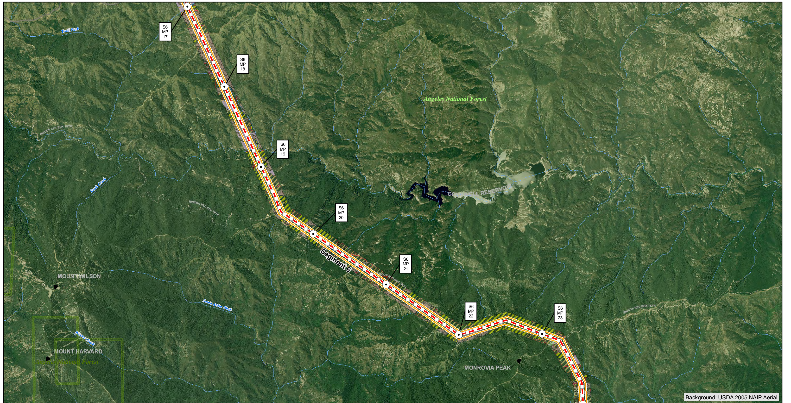
Background: USDA 2005 NAIP Aerial