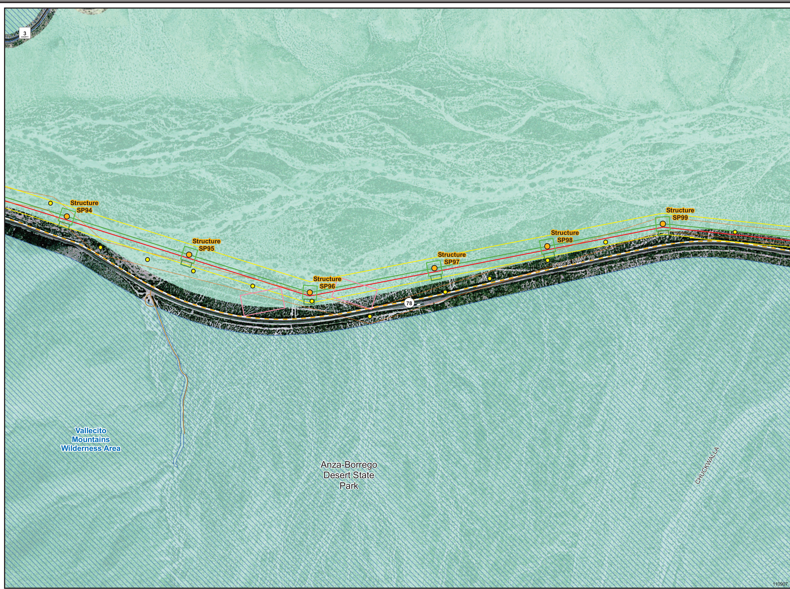
Appendix 11B, ABDSP Detail. Figure 11B-17