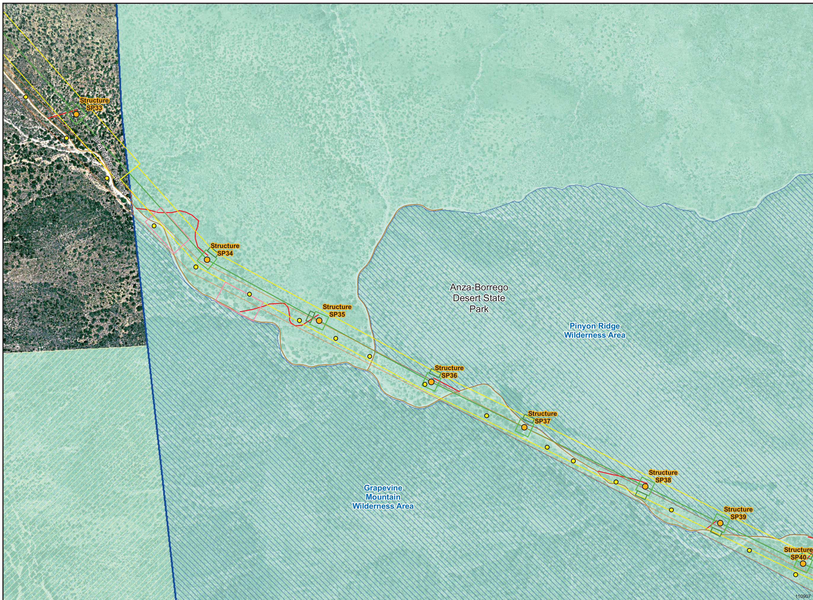
Appendix 11B, ABDSP Detail. Figure 11B-26