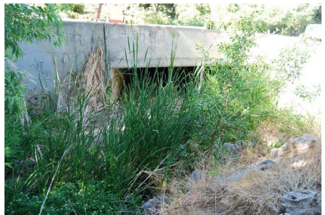
Downstream side of the creek