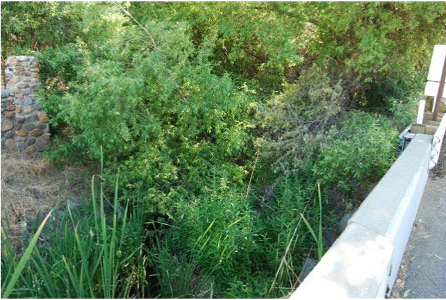
Upstream side of the creek