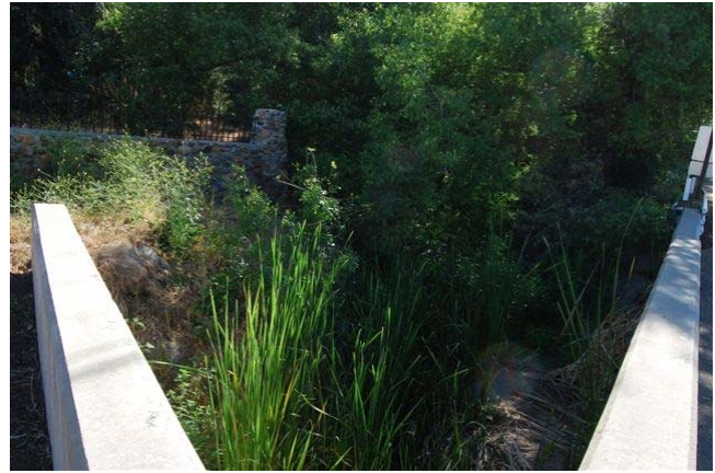
Upstream side of the creek