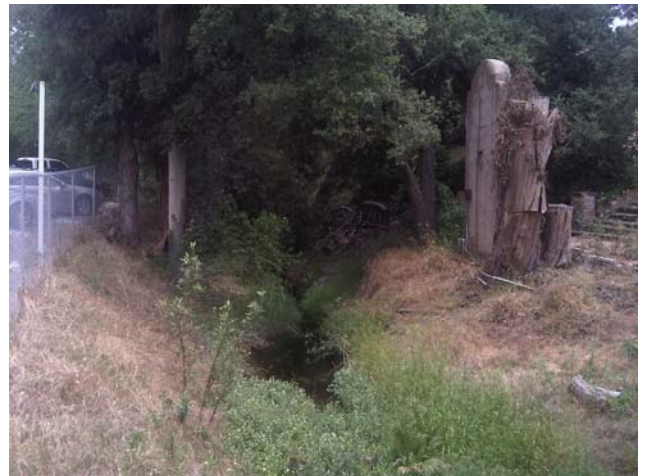
Downstream side (approx. 100 feet from the culvert)