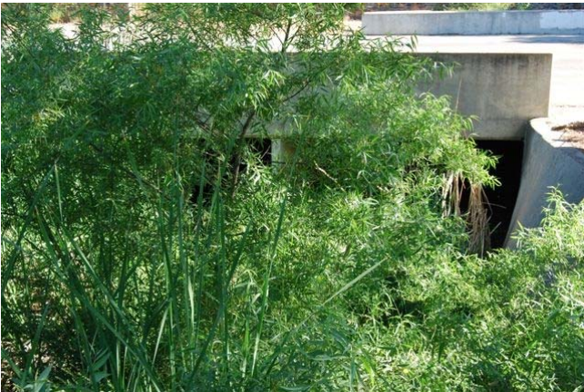
Upstream side of the creek