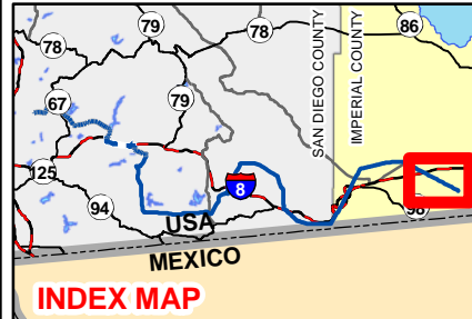
Figure 2 STRUCTURES EP363-1 TO EP333