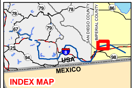
Figure 4 STRUCTURES EP324 TO EP301