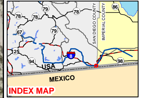
Figure 7 STRUCTURES EP255-2 TO EP252A-1 (JADE) SDGE A Sempra Energy utility May 2010