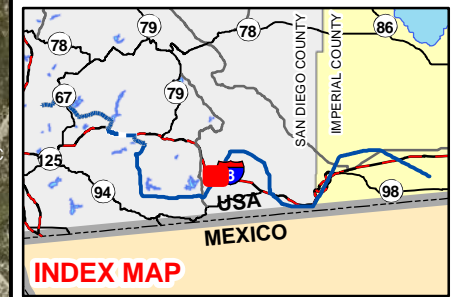
Figure 17 STRUCTURES EP122 to EP108-2 (LA POSTA)