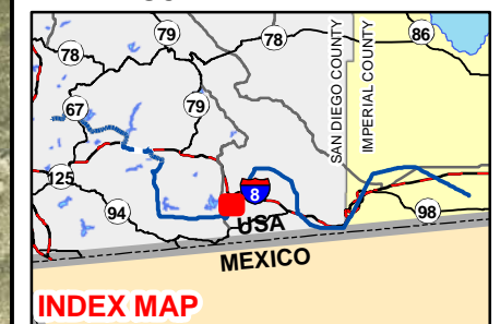
Figure 18 STRUCTURES EP108-2 to EP99-2 (LENAC)