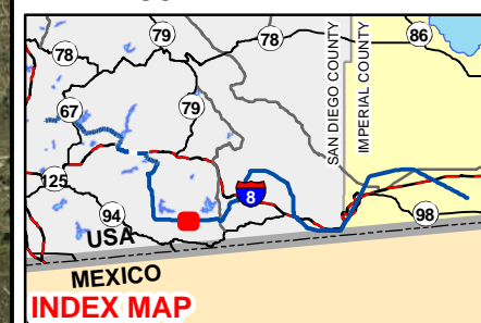
Figure 23 STRUCTURES EP62A-1 TO EP47-2 (PORTRERO)