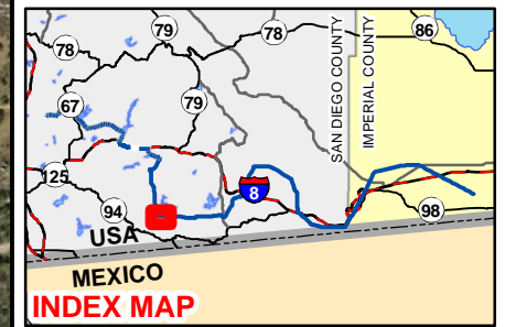
Figure 24 STRUCTURES EP47-2 TO EP39-1