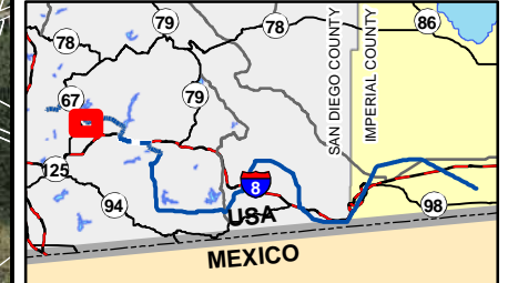
Figure 36 STRUCTURES CP53-1 TO CP44-1 (HIGH MEADOW RANCH)