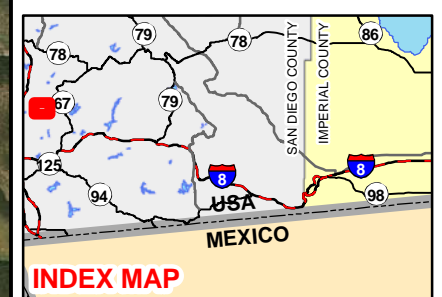
Figure 44 SYCAMORE CANYON - SCRIPPS SUBSTATION RECONDUCTORING PROJECT OVERVIEW