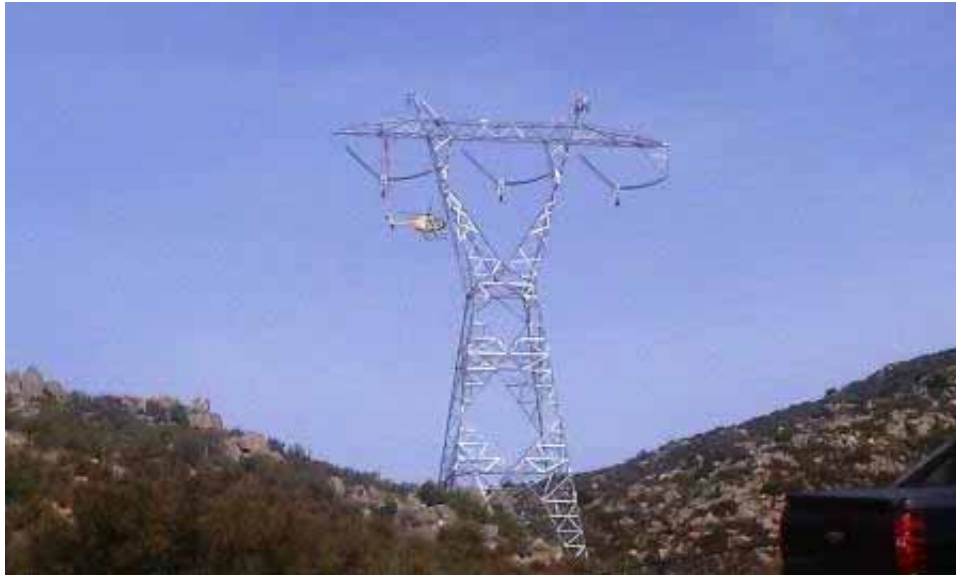
Figure 6: Pulling sock line from EP141 to EP131. (Link 2)