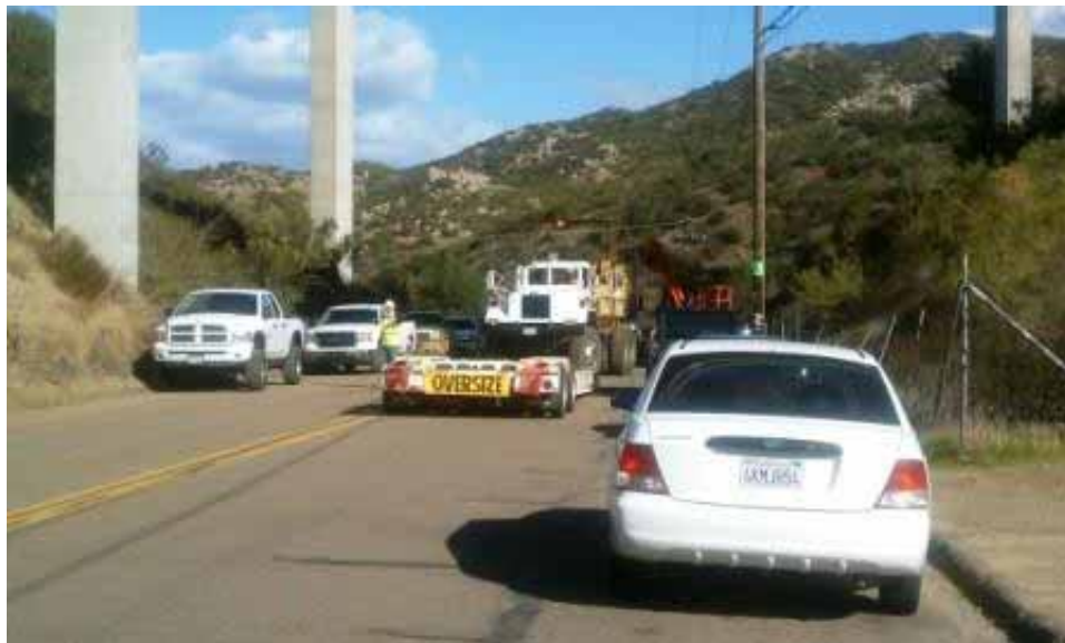
Figure 8: Unloading equipment on Puetz Valley Road near Bauer Bridge. (Link 4)