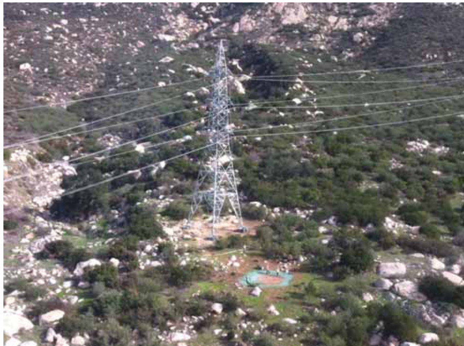
Figure 12: Conductor pulled through at CP66-2 (GE buffer). (Link 5)