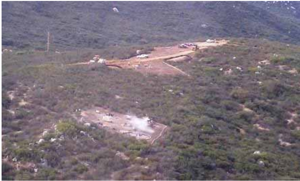
Figure 5: Micropiling at EP8-2; EP9-1 & pull site in background on USFS land. (Link 2)