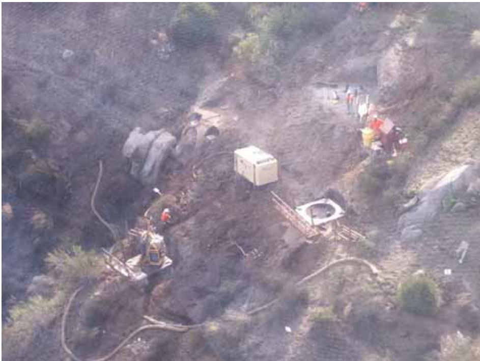
Figure 10: Micropile drilling operations at CP61-1. (Link 5)