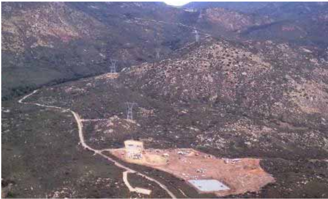
Figure 7: View from Thing Valley Construction Yard to EP141 (through GE buffer). (Link 2)