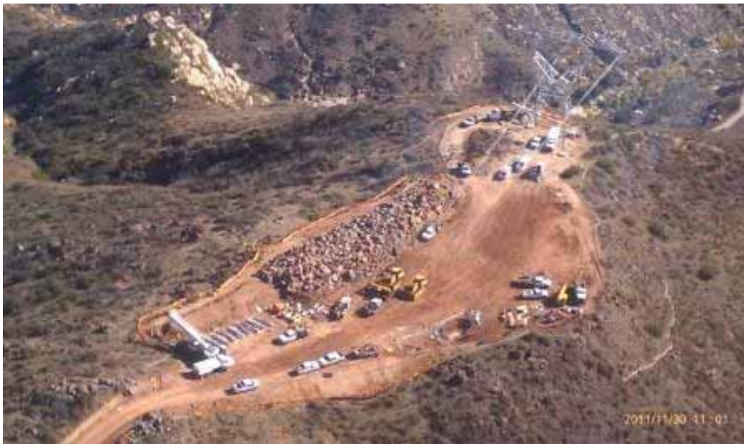
Figure 2: Wire stringing activities (through GE buffer) at EP42 and Barrett Construction Yard. (Link 2)