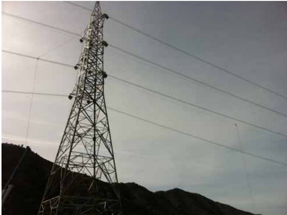
Figure 11: Wire stringing operations at CP69-2. (Link 5)