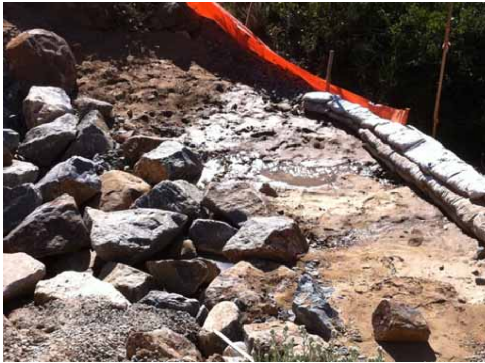
Figure 13: Southern dissipater with clear water flowing. (Link 3)