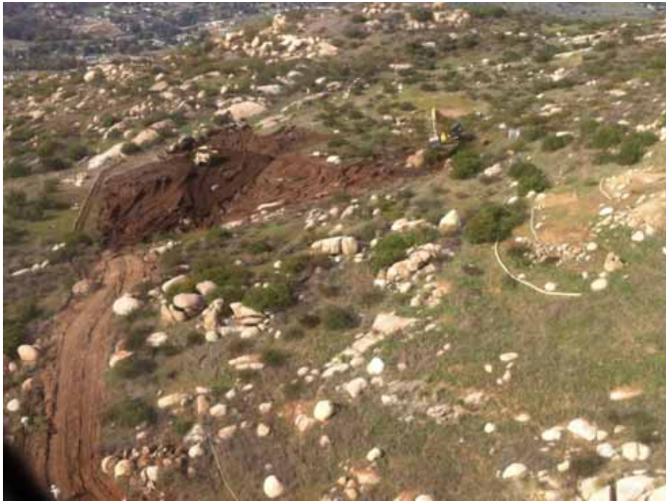
Figure 9: Grading CP49 pull site. (Link 5)