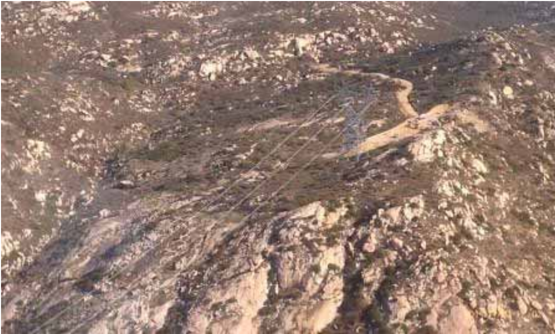
Figure 1: EP47 and pull site with wire stringing activities underway (through GE buffer). (Link 2)