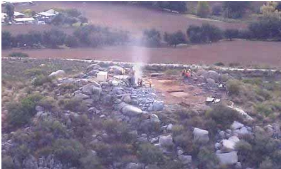
Figure 4: Micropile drilling at EP7-1. ( Link 2 )