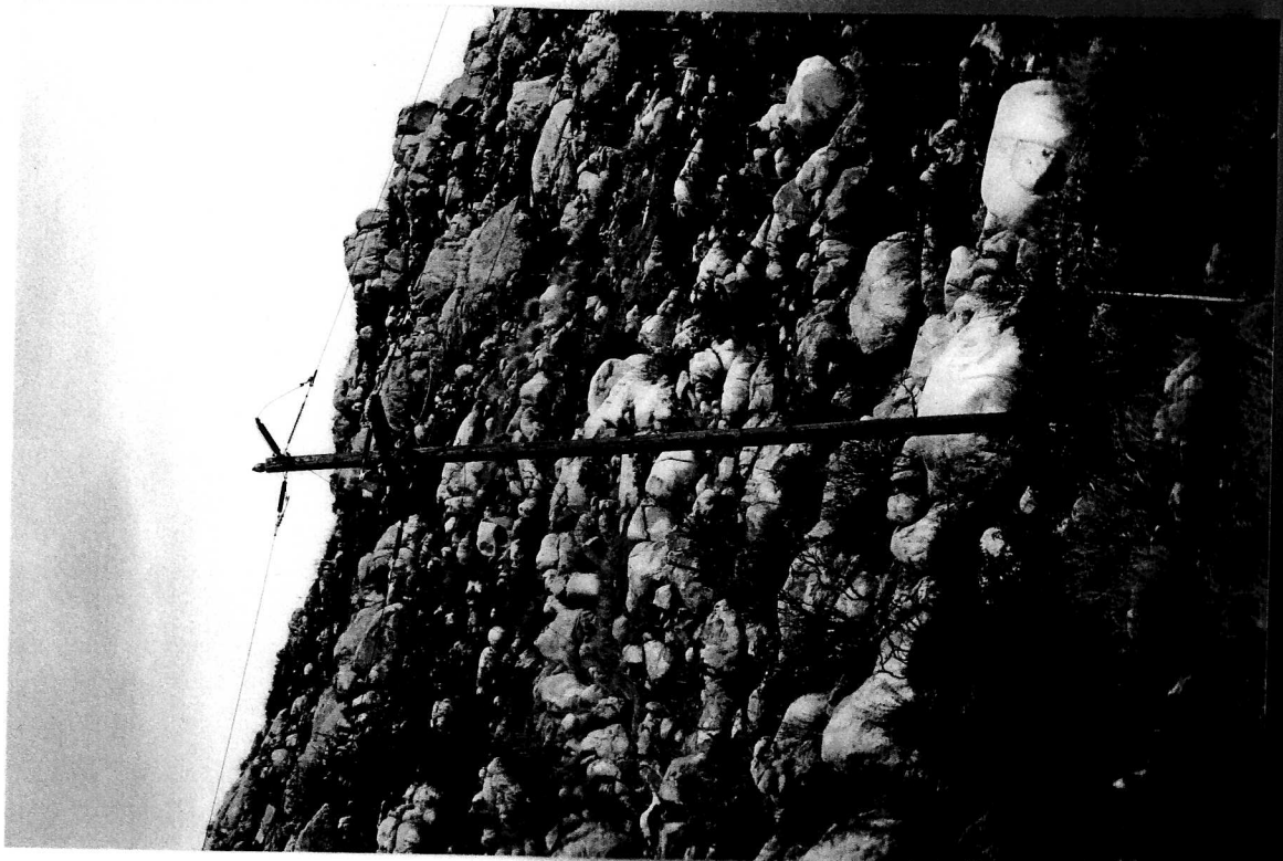
Bird on pole

Hawks will fly all around One landed on powerline and started fire approx 2000; but was put out by neighbors