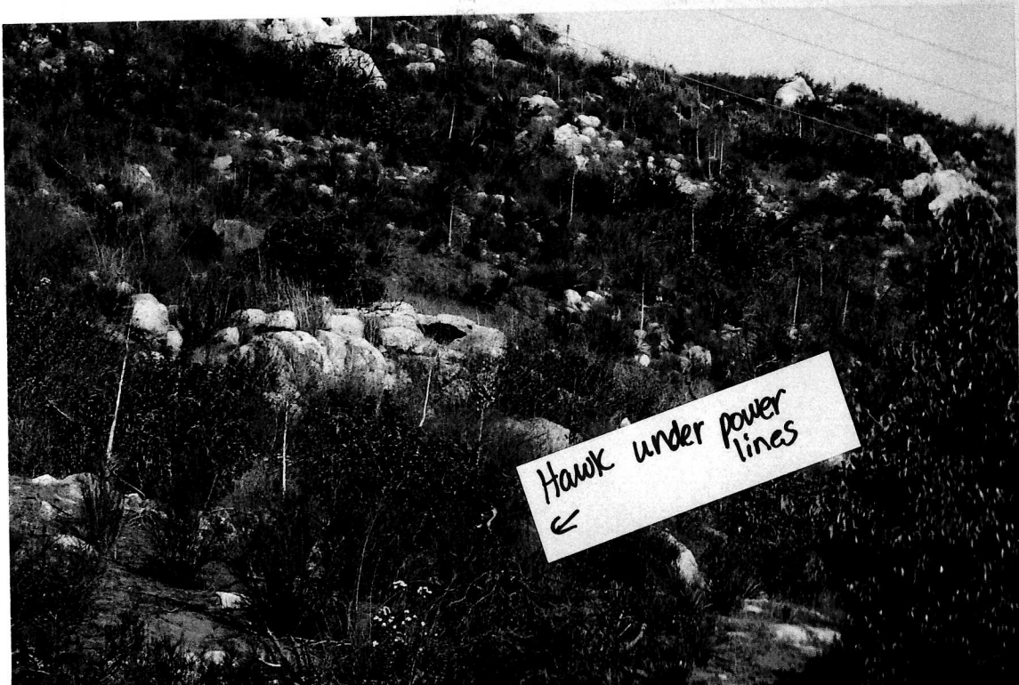
Hawk under power lines ←

Hawks will fly all around One landed on powerline and started fire approx 2000; but was put out by neighbors