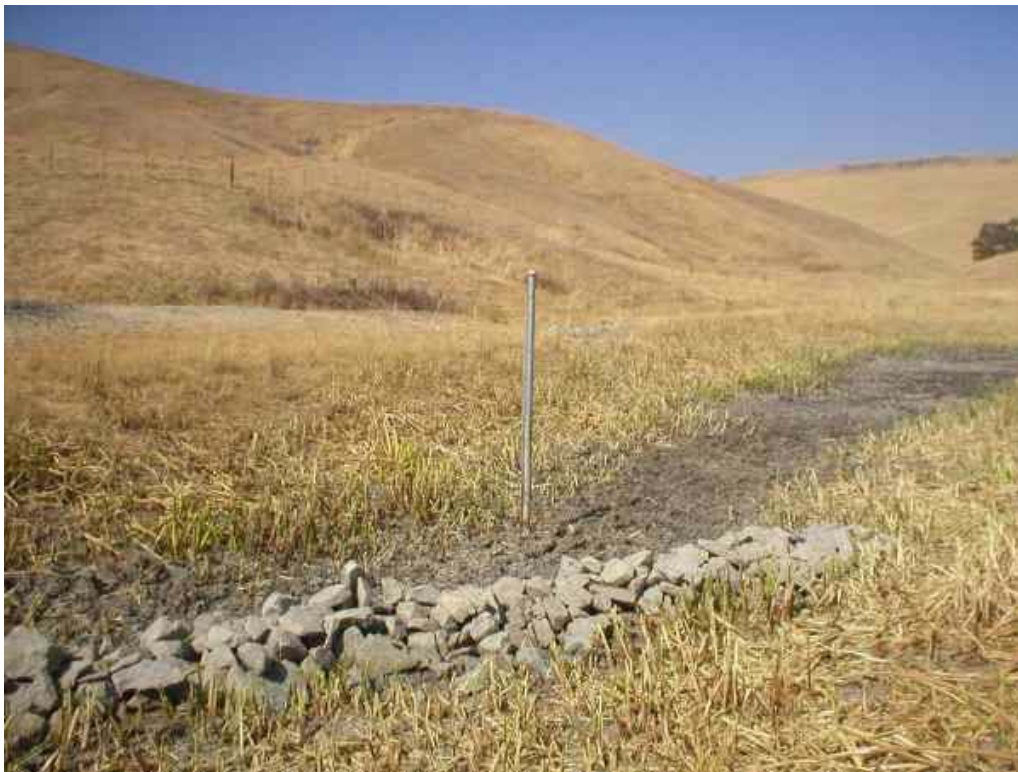
Figure 2 – The engineered pond at the mitigation area site is now dry, September 27, 2006.