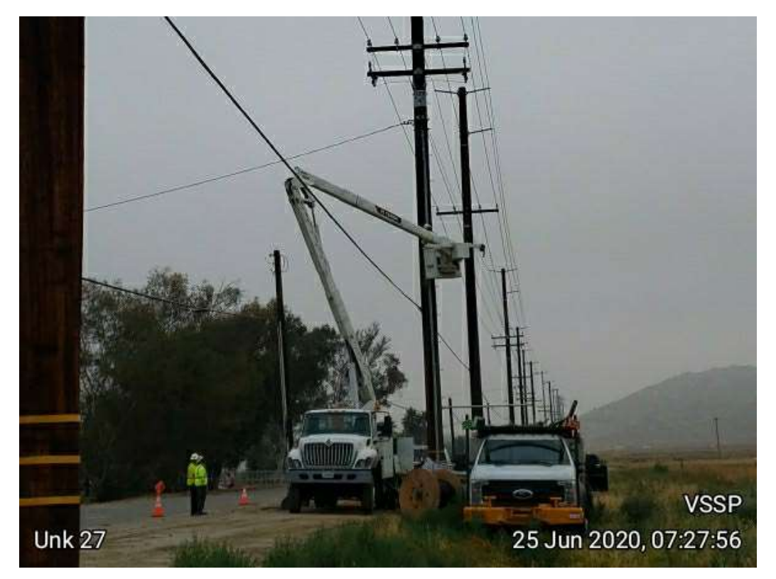
Photo 3 – Handhold installation at Construction Area UNK27 (June 25, 2020) (Photo courtesy of SCE).