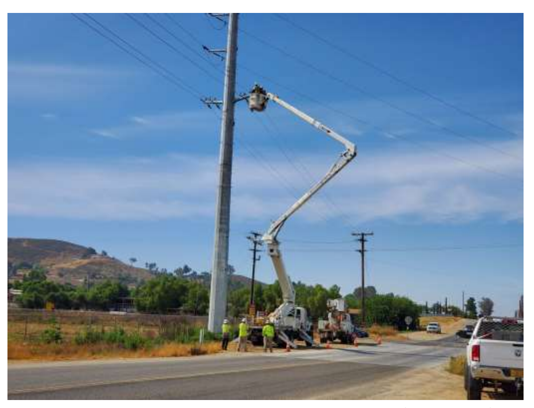
Photo 2 – Bird guard installation at Construction Area UNK154 (June 24, 2020).