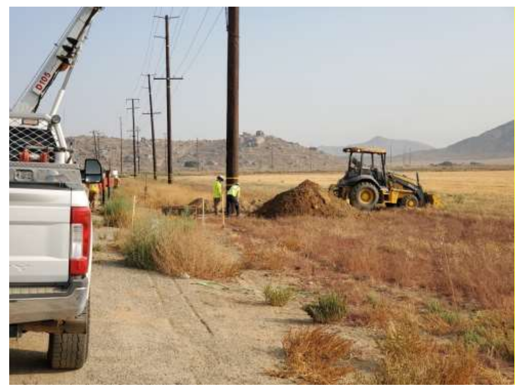
Photo 1 – Pole realignment at Construction Area UNK101 (September 15, 2020).