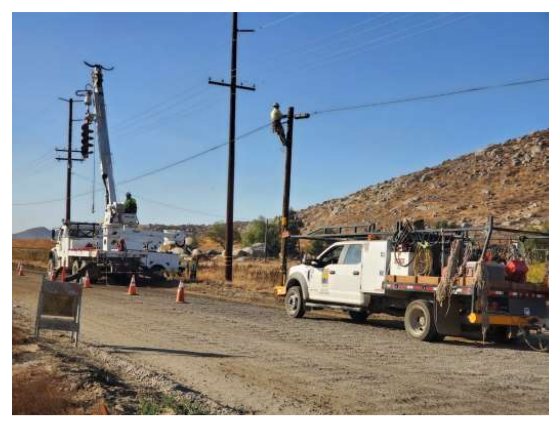
Photo 3 – Pole butt removal at Construction Area UNK56 (September 23, 2020).