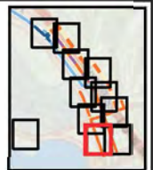
Figure B.1-3j: Detailed Project Components

Note: Underground alignments area preliminary and will not be finalized until final engineering is complete.