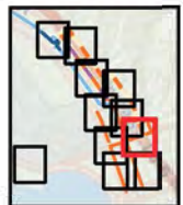
Figure B.1-3f: Detailed Project Components

Note: Underground alignments area preliminary and will not be finalized until final engineering is complete.