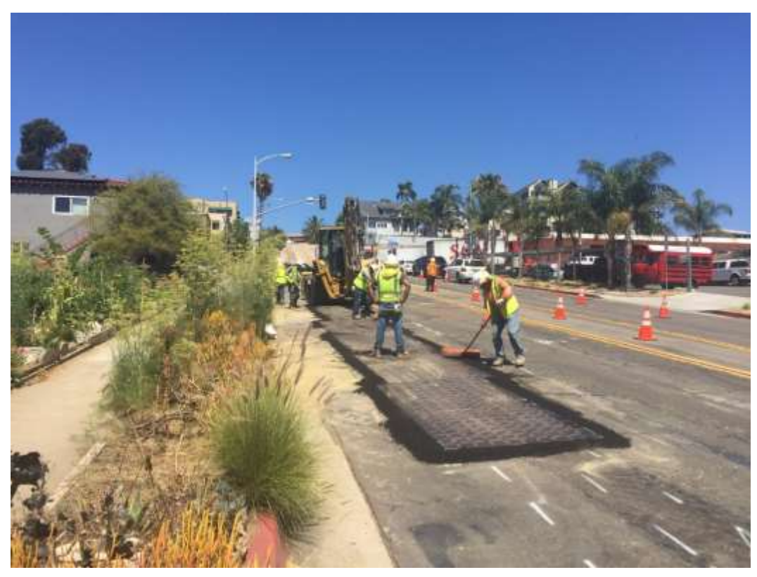
Figure 3 – Trench backfilling and clean-up activities along W. Laurel Street, 12-kV Underground.