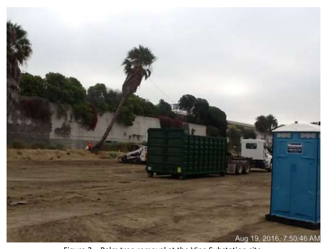
Figure 2 – Palm tree removal at the Vine Substation site.