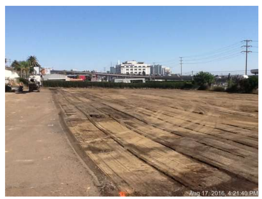
Figure 1 – Asphalt removal at the Vine Substation site. Asphalt was hauled off site as it was removed.