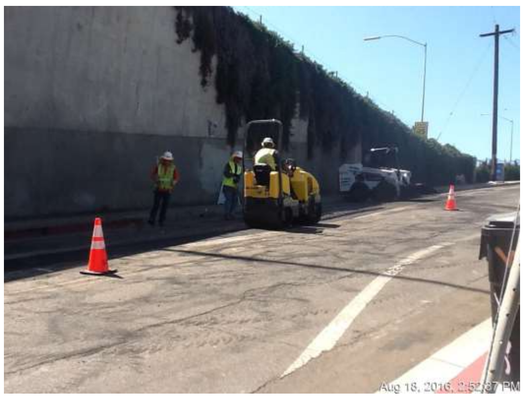
Figure 4 – Temporary paving of the completed trench, Columbia Street 12-kV Underground.