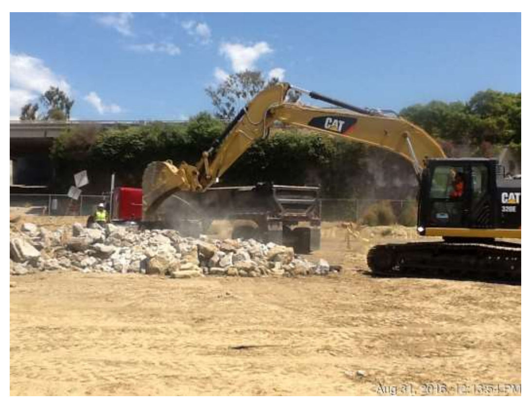
Figure 2 – The foundation was crushed into pieces and hauled offsite for disposal.