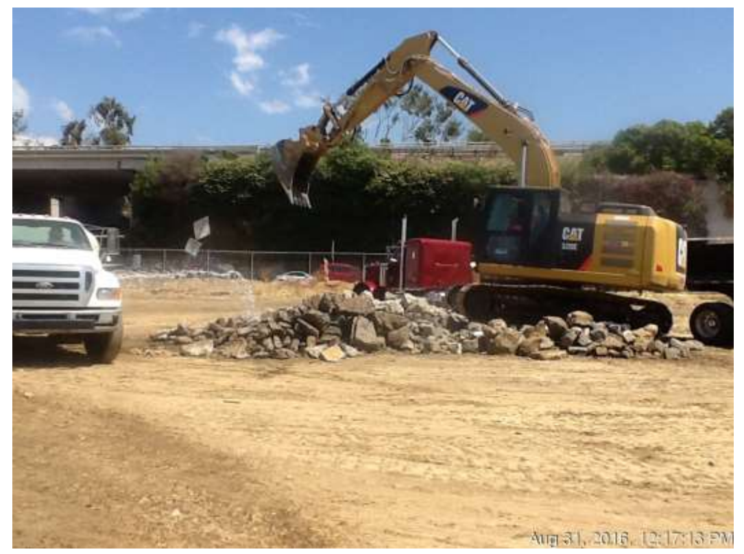
Figure 6 – Water was applied to the debris pile to minimize dust from the demolition and hauling operations.