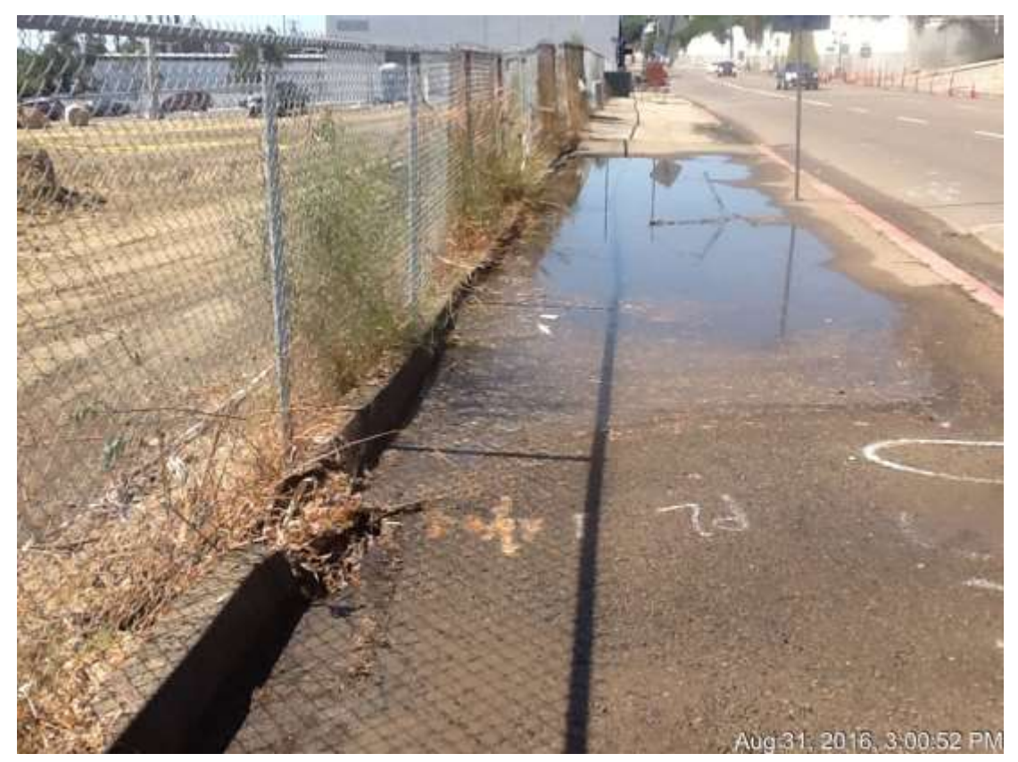
Figure 4 – Water from an accidental release of hydrant water pooled up along Kettner Boulevard.