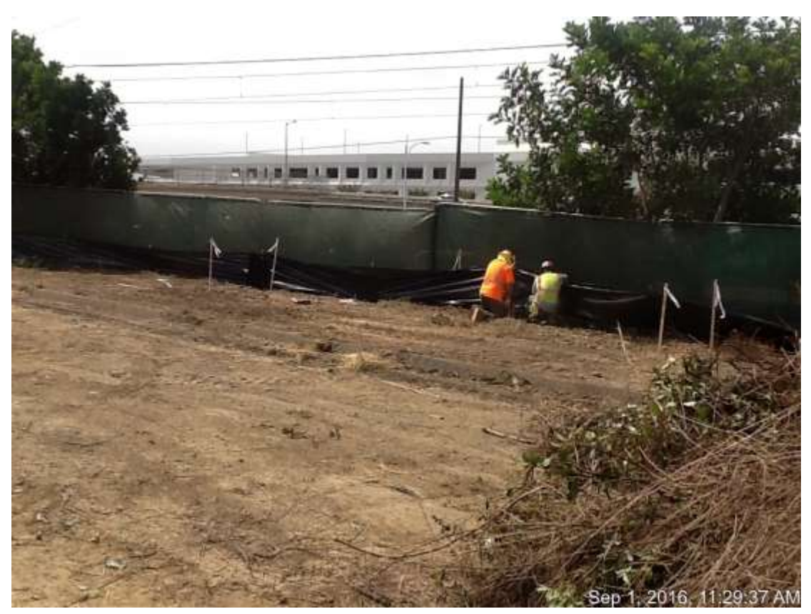
Figure 3 – Temporary fence installation along the railroad right-of-way.