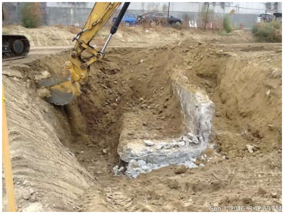
Figure 1 – Demolition of the concrete foundation identified at the Vine Substation site.