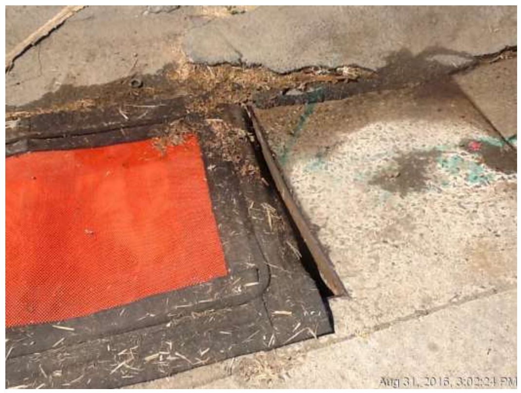
Figure 5 – The hydrant water flowed into a storm drain along Vine Street and also flowed onto the substation site.