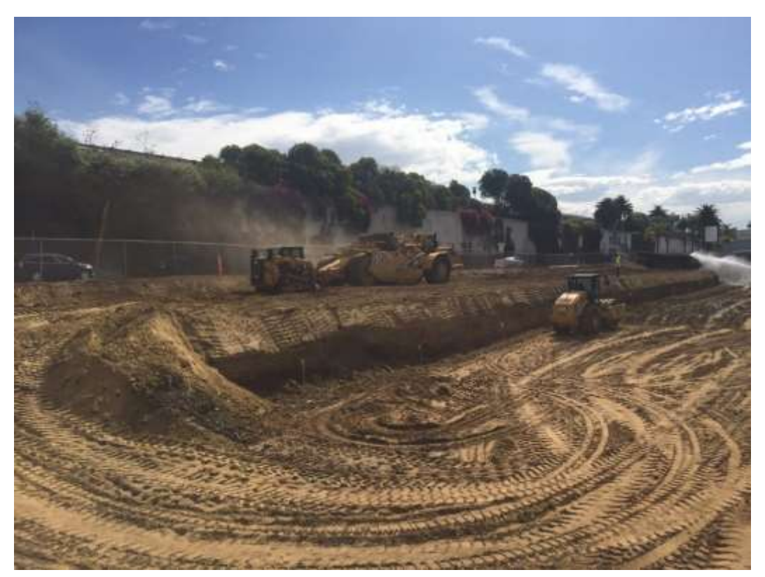
Figure 1 – Dust from grading operations of the Vine Substation site blowing onto Kettner Boulevard.