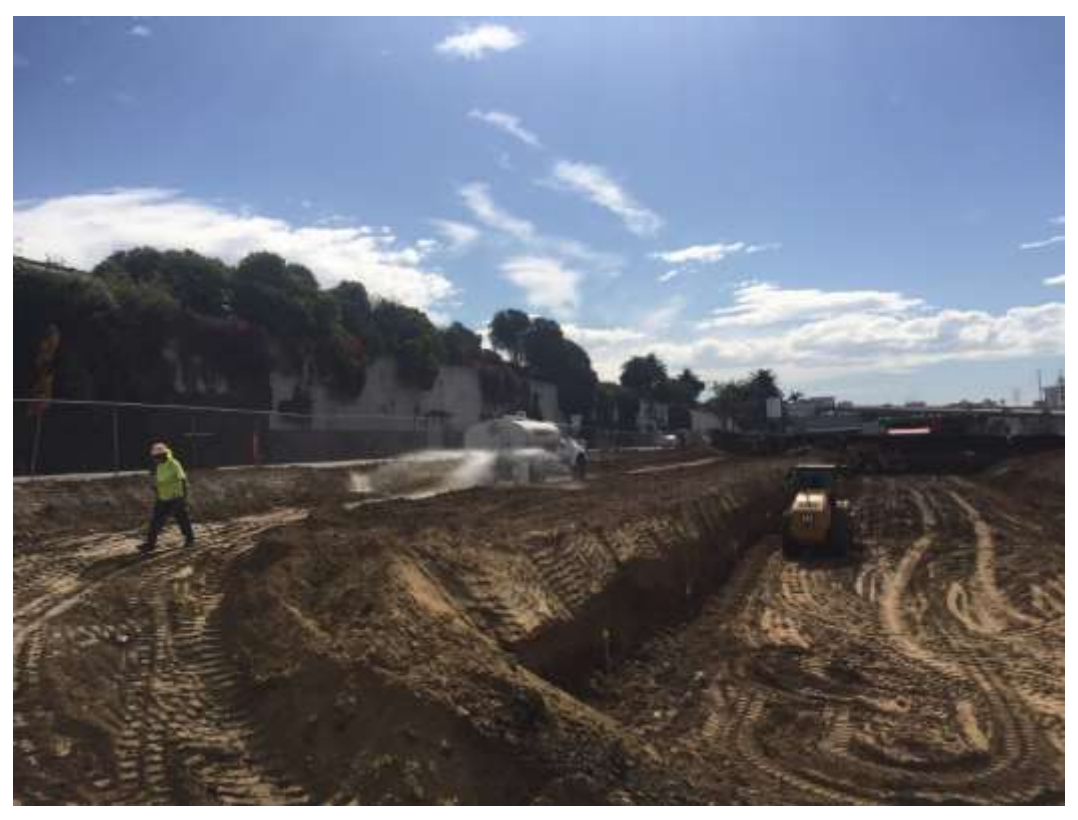
Figure 2 – The water truck followed the scraper to control fugitive dust.