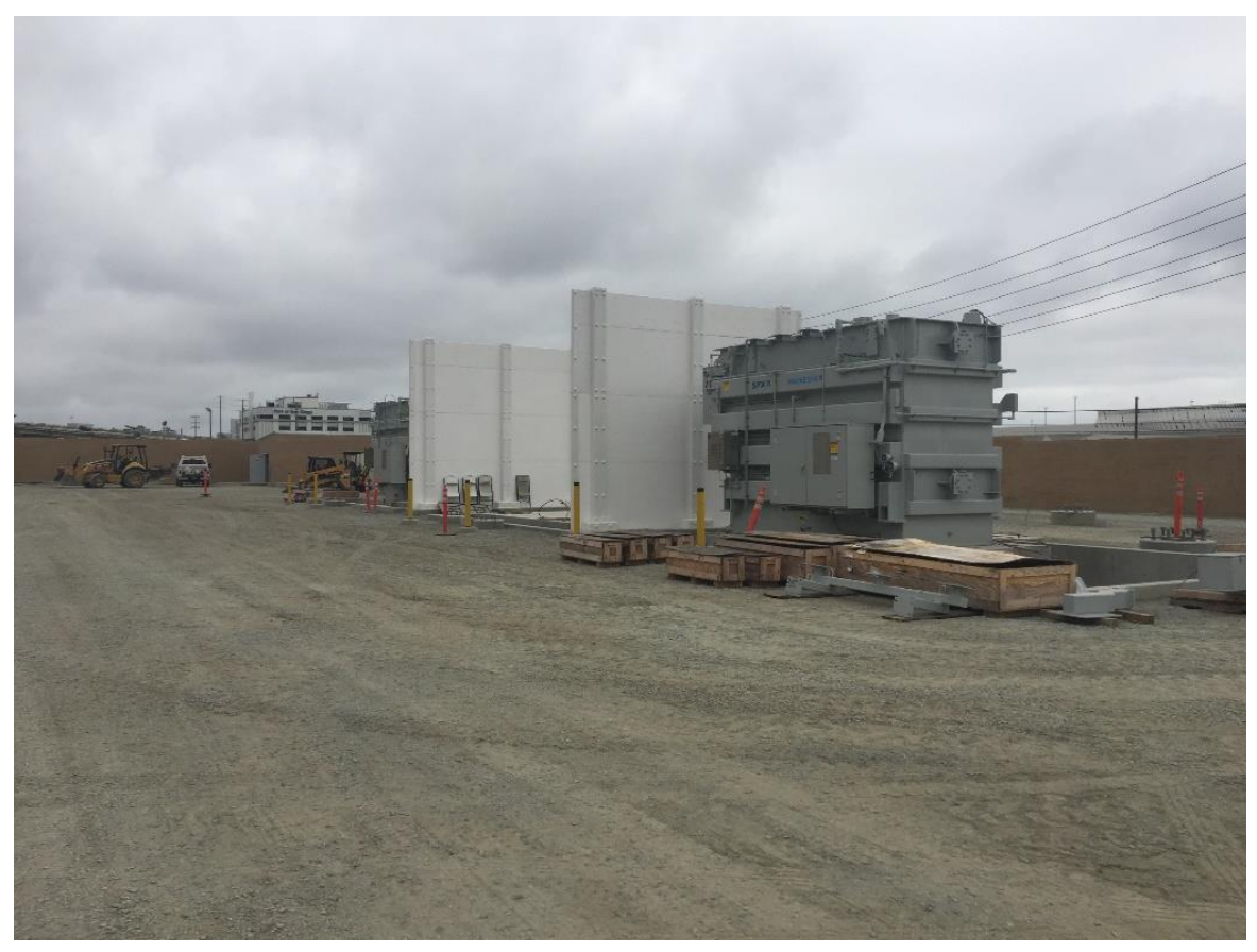
Figure 2 – Transformers were delivered and installed between fire walls at the Vine Substation.