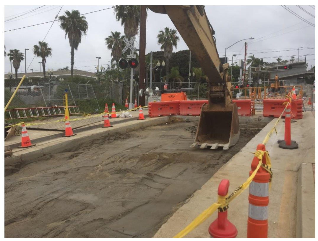
Figure 3 – Crews backfilled the entry pit after the jack and bore was completed. One lane of traffic along Palm Street was closed 24 hours a day during construction.