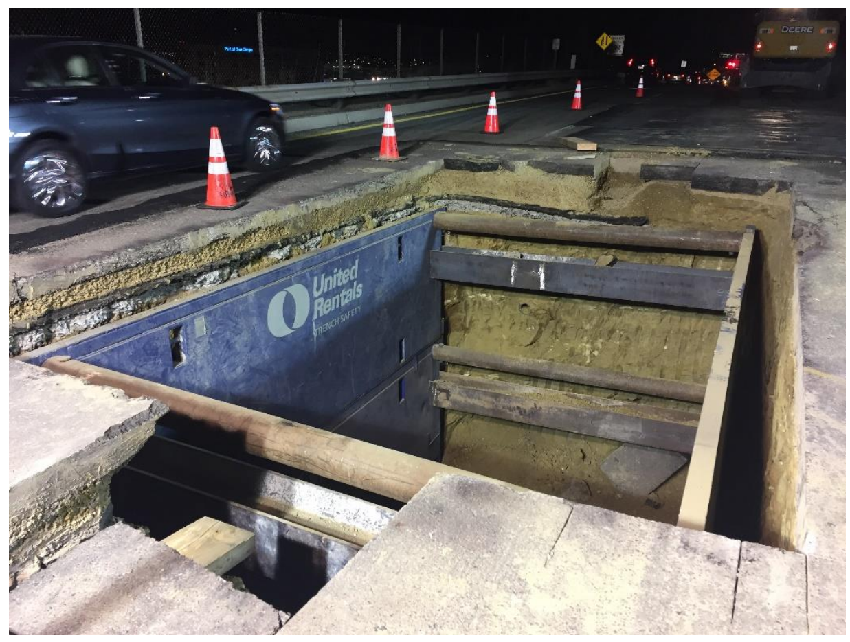
Figure 5 – Vault excavation along the India Street 12 kV portion. The first vault was set on June 7.