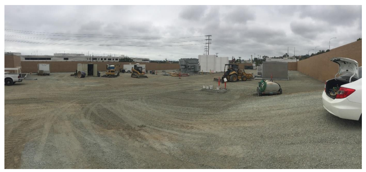
Figure 1 – DCX crews conducted final grading and base rock installation at the Vine Substation.