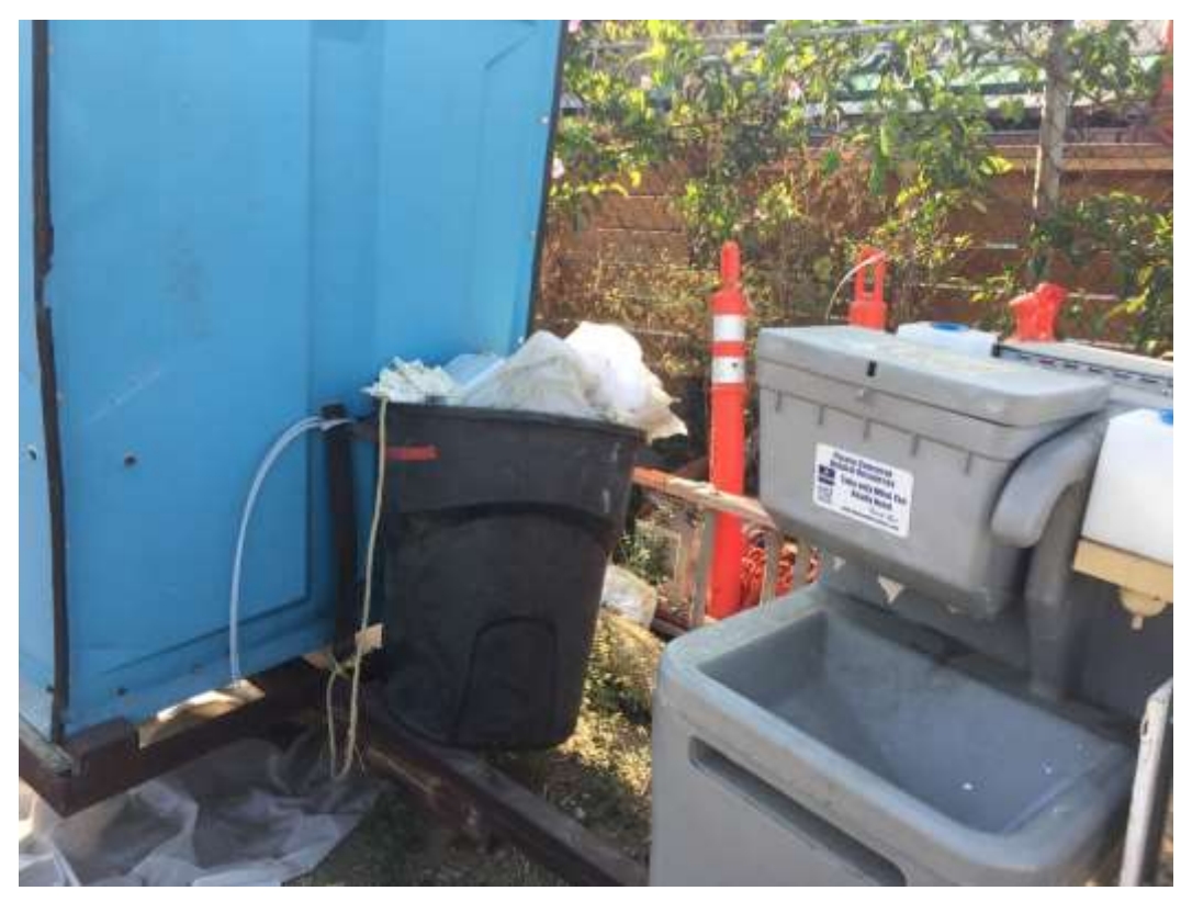
Figure 4 – The CPUC EM observed an uncovered and overflowing trash can used by the NPL crews staged near India Street after their work shift had ended.