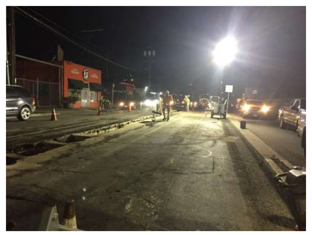
Figure 2 – NPL crews working within traffic control areas along India Street.