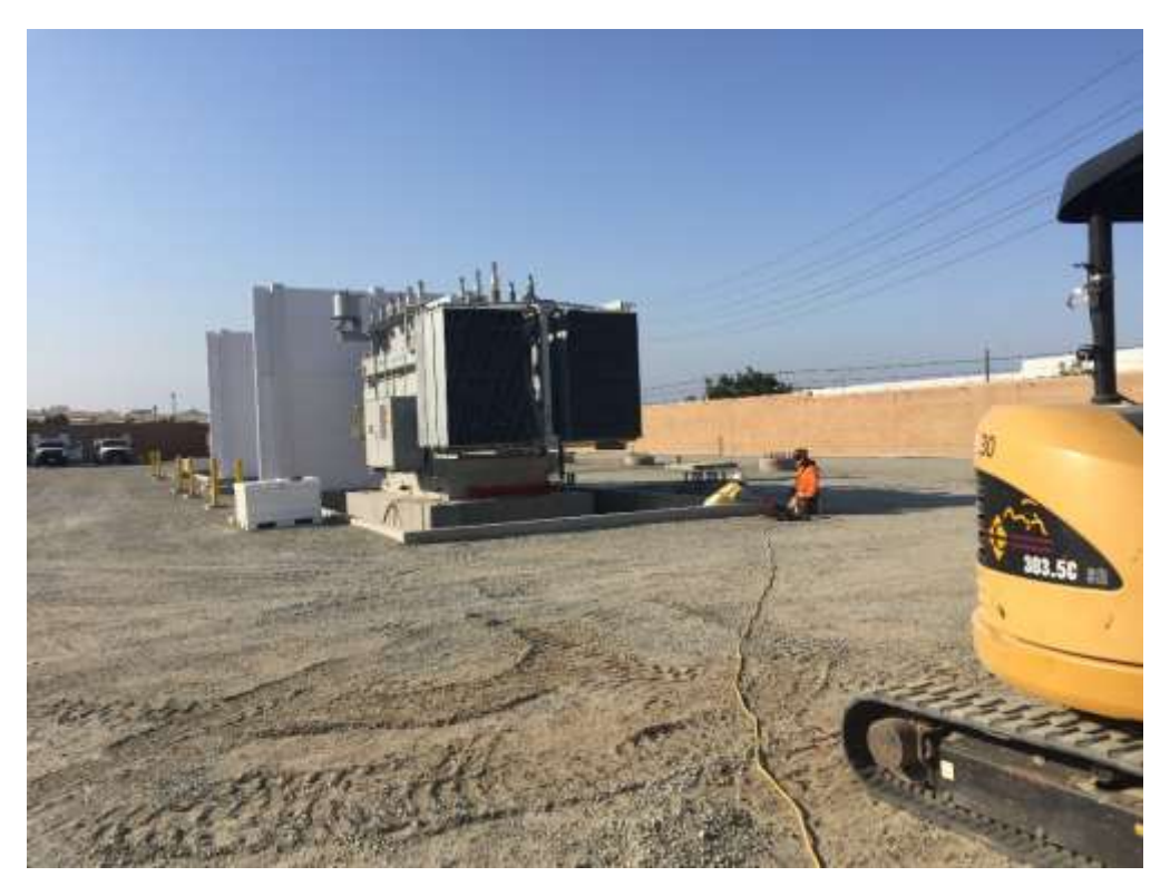
Figure 1 – Kearney crews continued with component installation at the Vine Substation.