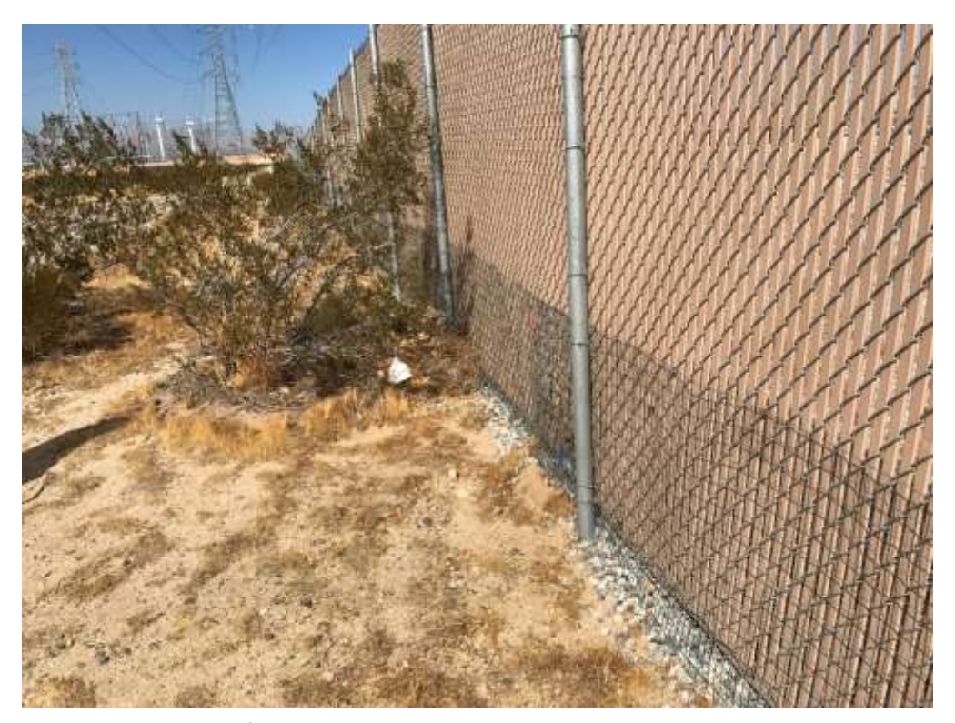
Figure 1 – Exclusion fencing repairs have been completed at several locations at the Devers MY.