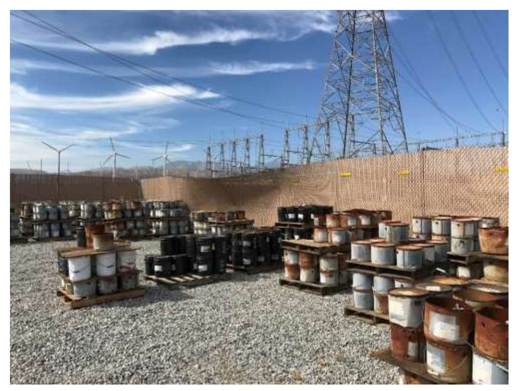
Figure 2 – Wind damaged privacy fencing along the northern wall of the Devers MY.