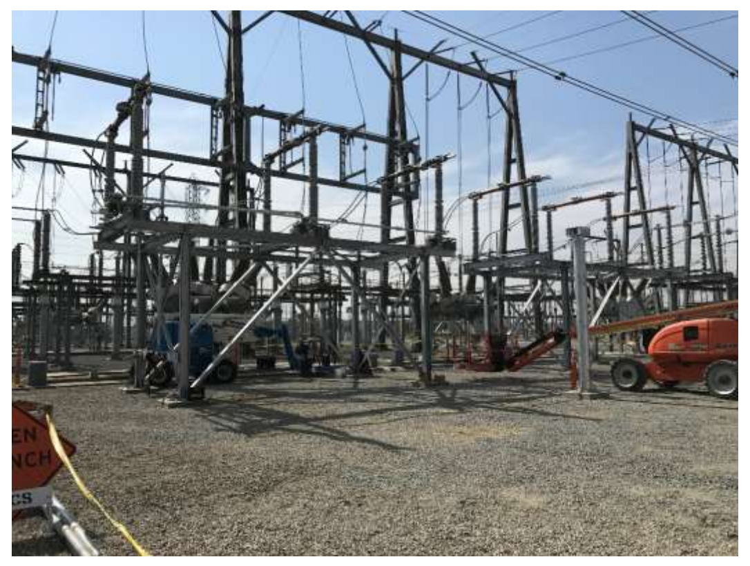
Figure 4 – Connecting leads and adjusting grounds at San Bernardino Substation.