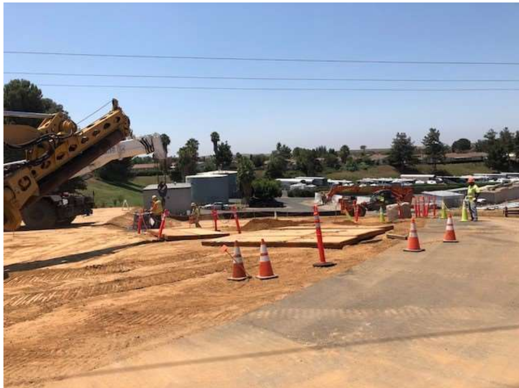
Photo 4 – Foundation activities occurring at Tower Site 4X47 (July 26, 2018).