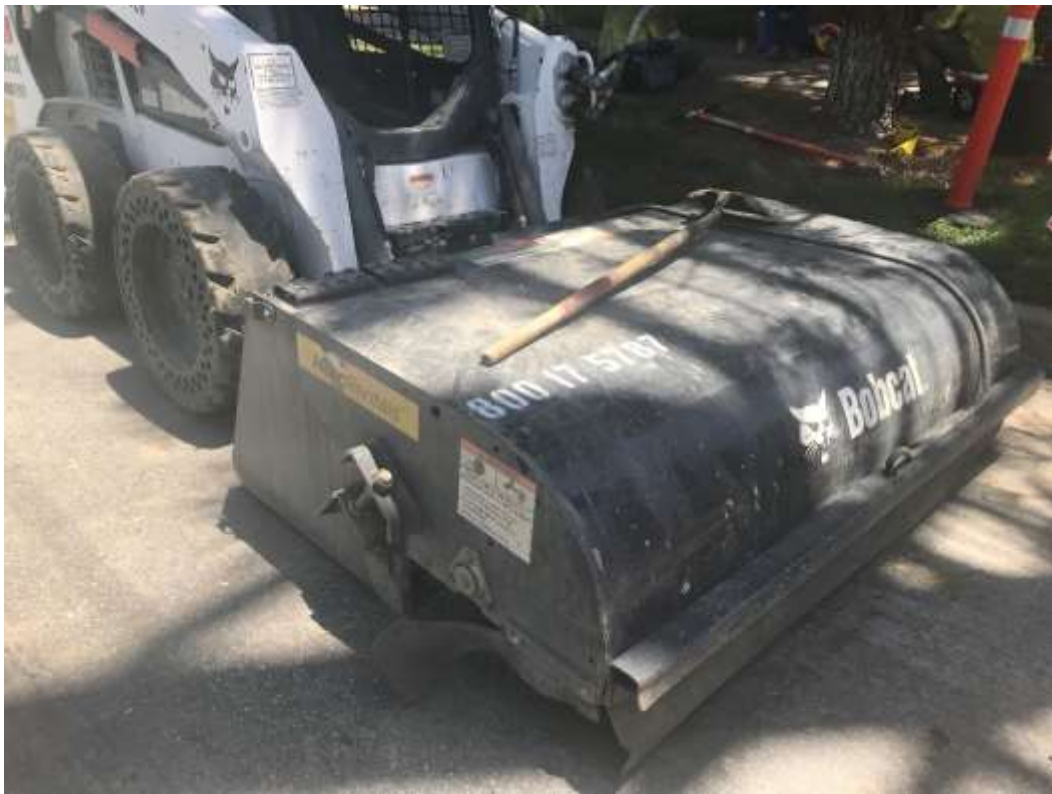
Photo 3 – Hotline crew using sweeper attachment which was inconsistent with what was proposed in the SWPPP (July 24, 2018).