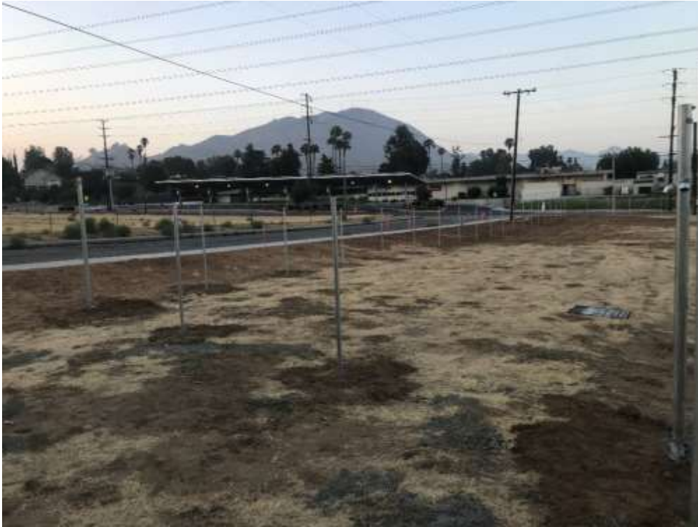
Photo 1 – Installation of fence posts at the Grand Terrace MY (photo courtesy of SCE, July 27, 2018).