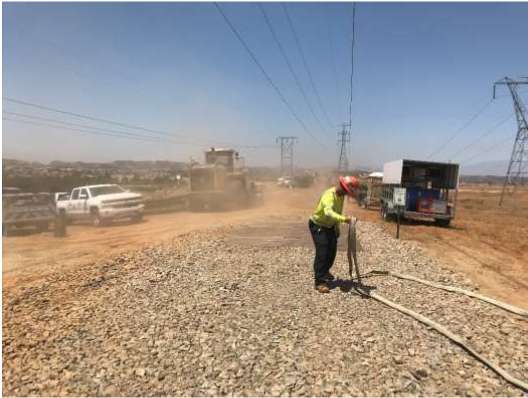
Photo 5 – Fugitive dust during foundation activities at Tower Site 4X47 (July 26, 2018).