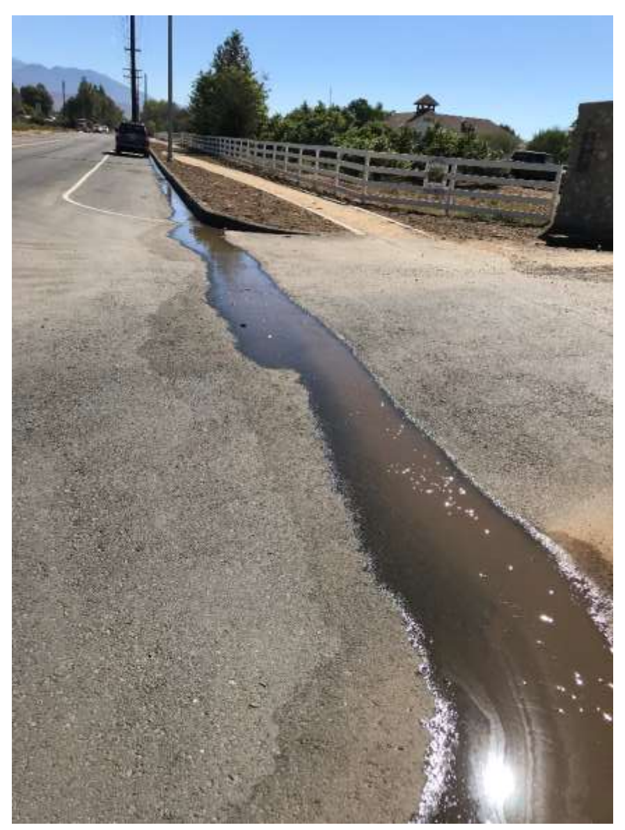
Photo 3 – Non-stormwater discharge flowing approximately 1000-feet down Orange Avenue. No BMPs were present (September 18, 2018).