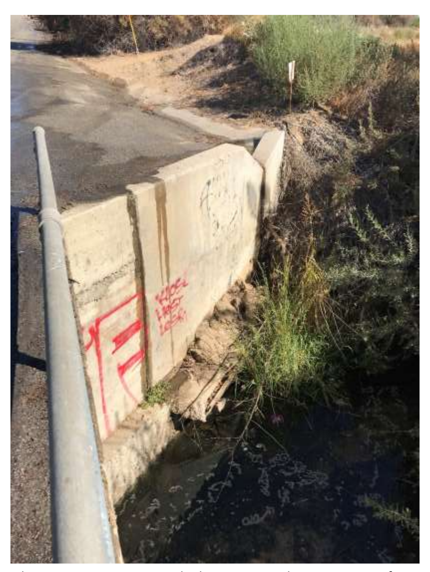
Photo 1 – Non-stormwater discharge into JD along Iowa Street from overwatering the road by subtransmission crews. No BMPs were present at the time. (September 18, 2018).