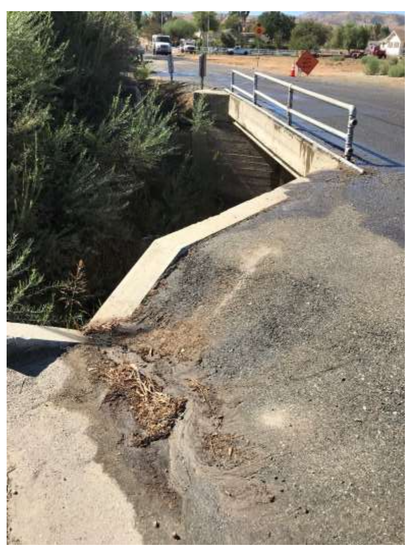
Photo 2 – Non-stormwater discharge into JD along Iowa Street from overwatering the road by subtransmission crews. No BMPs were present at the time. (September 18, 2018).