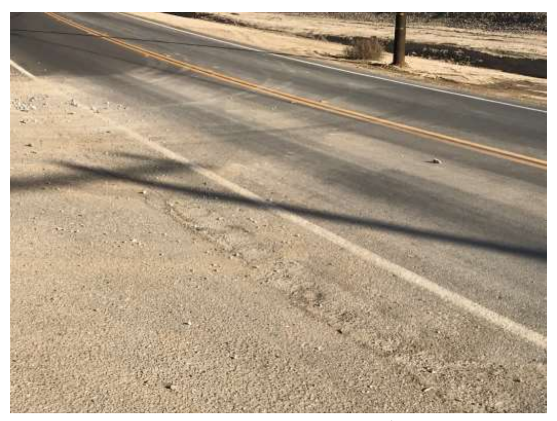
Photo 7 – 4-inch rock tracked onto San Timoteo Canyon Road from a stabilized entrance to Site 3X33 (September 20, 2018). The track out was attributed to another utility working on an unrelated project, but the BMP was installed by the West of Devers Project and will be maintained or removed.