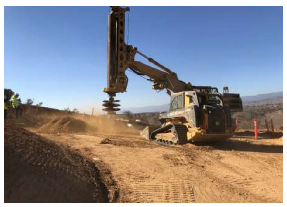
Photo 5 – Foundation drilling at Shoofly location 414. No water for fire suppression or dust abatement was on site (September 18, 2018).