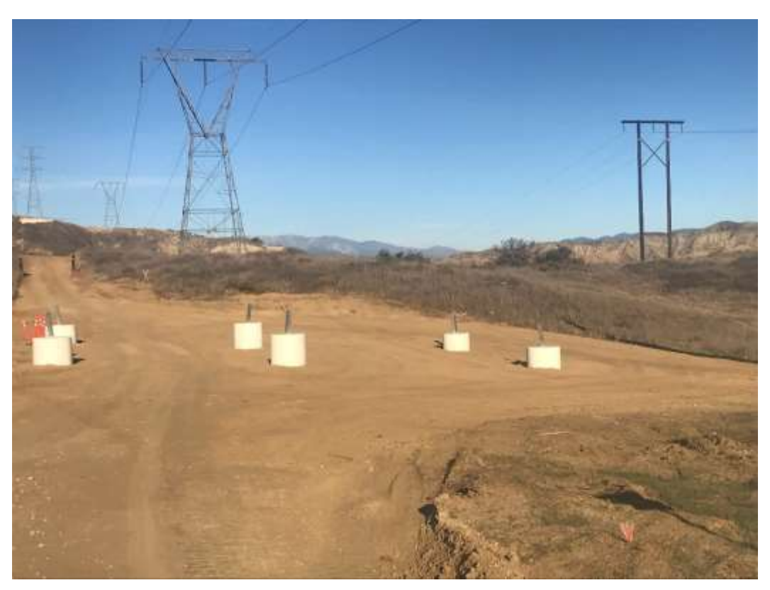
Photo 3 – Completed foundations at Segment 3 Tower 3X14 (October 31, 2018).