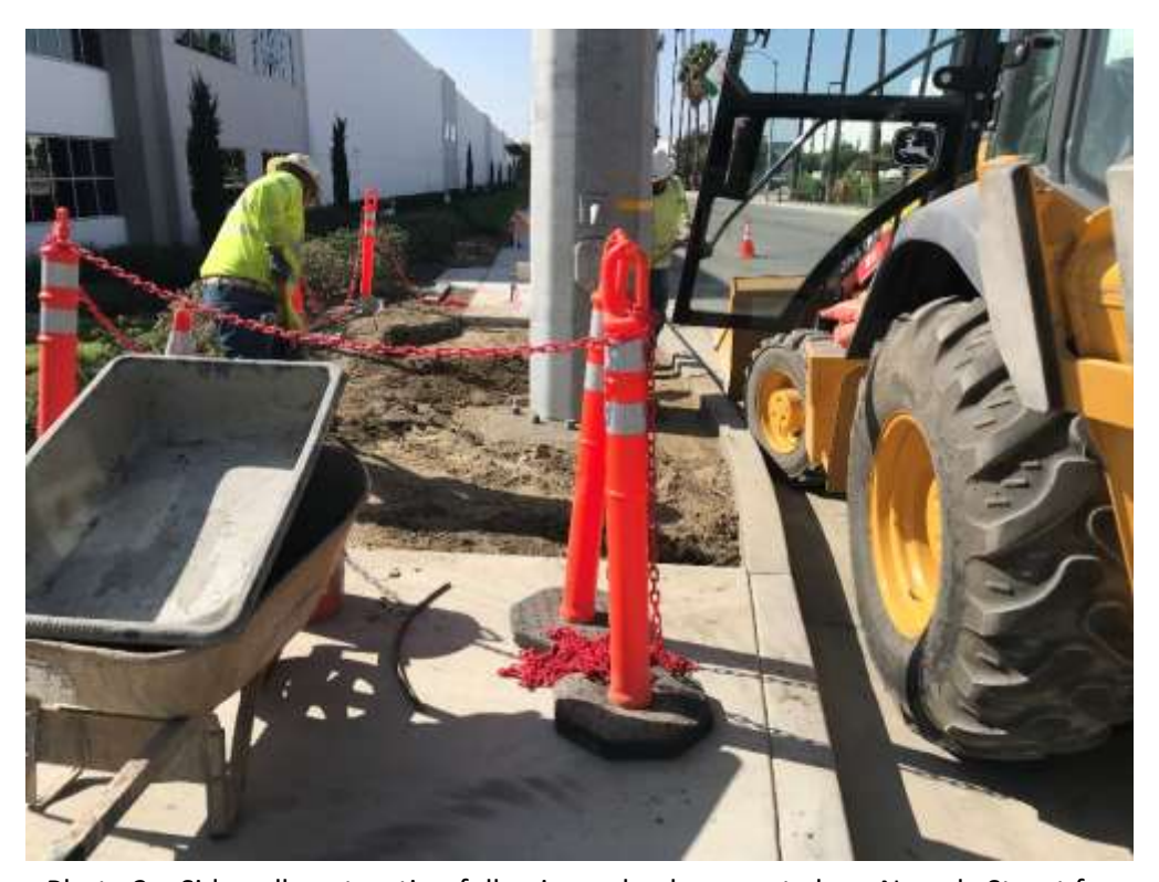
Photo 2 – Sidewalk restoration following pole placement along Nevada Street for the subtransmission work performed by Hotline Construction (October 30, 2018).