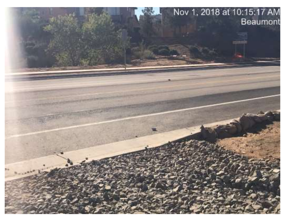
Photo 5 – Track out of rock onto Palmer Ave was reported by the CPUC EM (November 1, 2018).