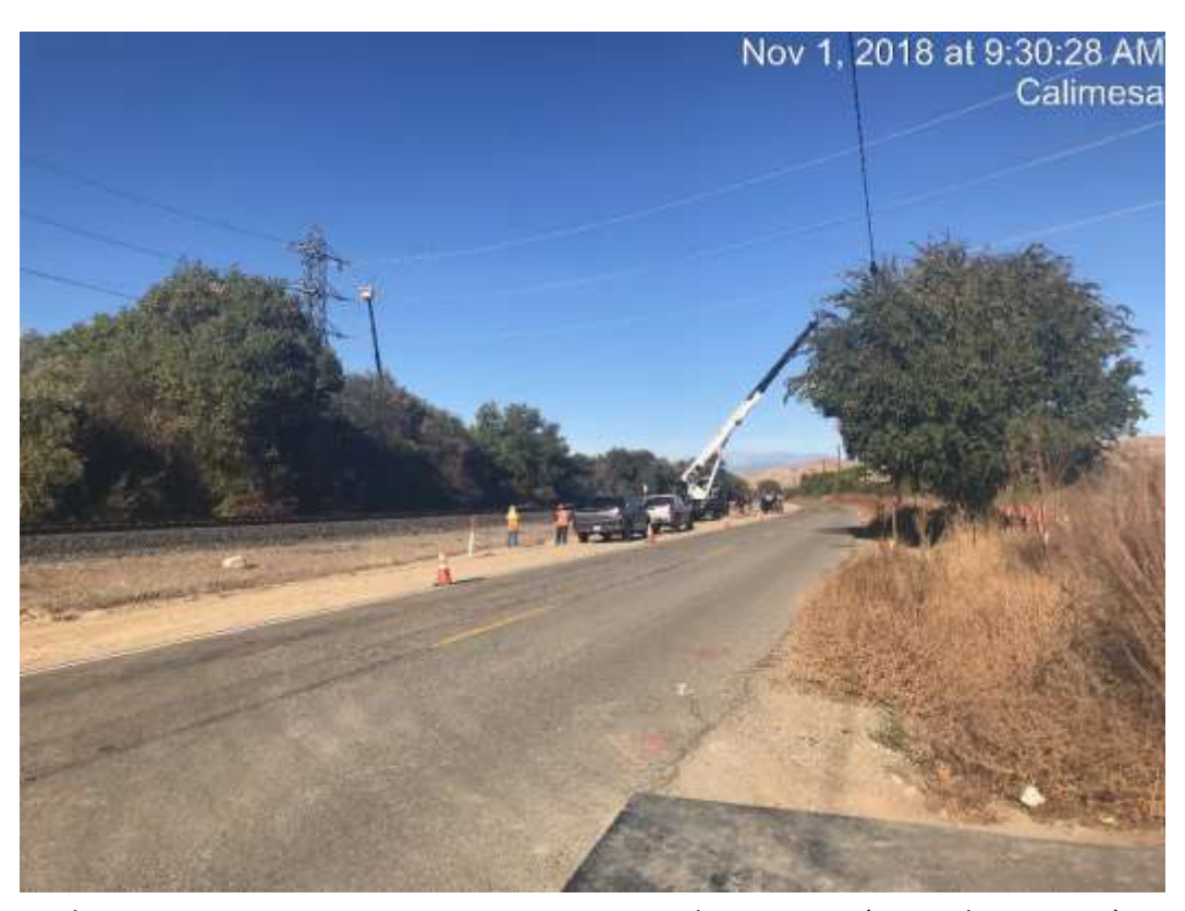
Photo 4 – Wire stringing across San Timoteo Road, Segment 4 (November 1, 2018).