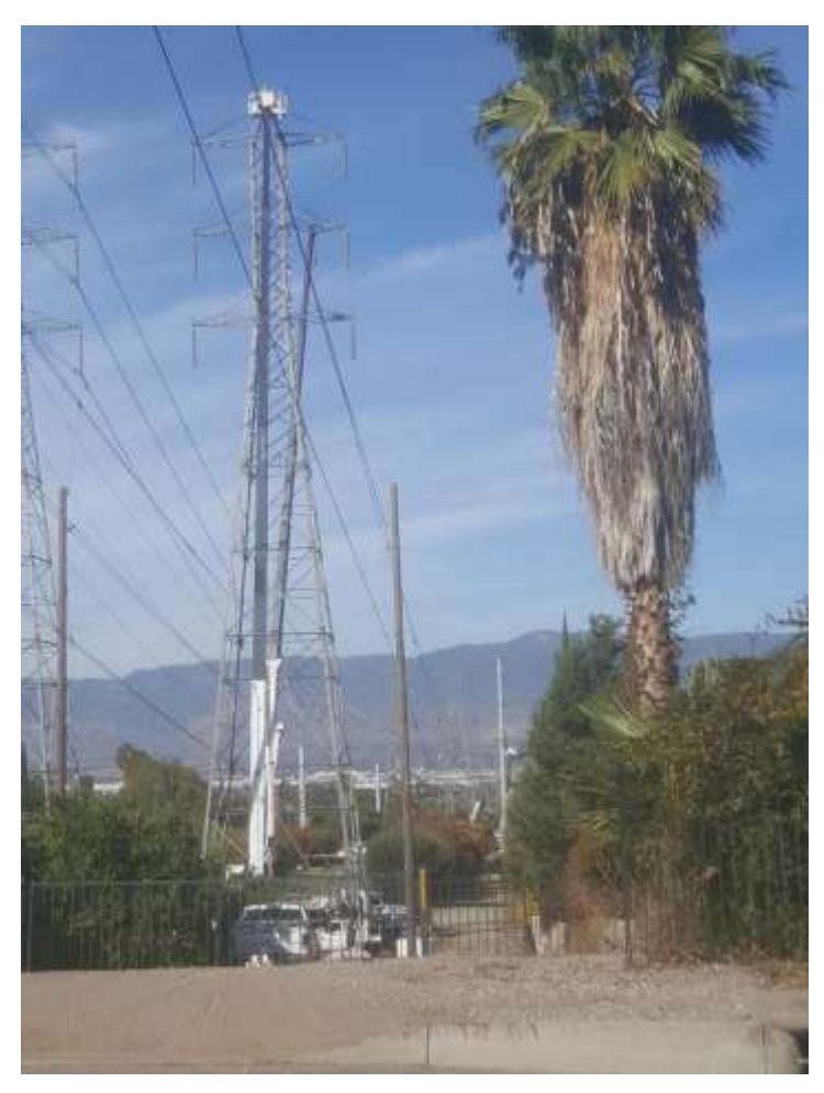
Photo 3 – Tower removal at Segment 1 Tower 1X04 (November 27, 2018).