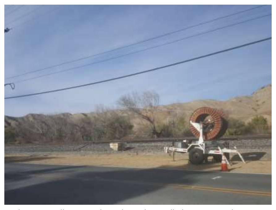
Photo 2 – Pulling rope through newly installed cross arms along San Timoteo Canyon Road (November 27, 2018).