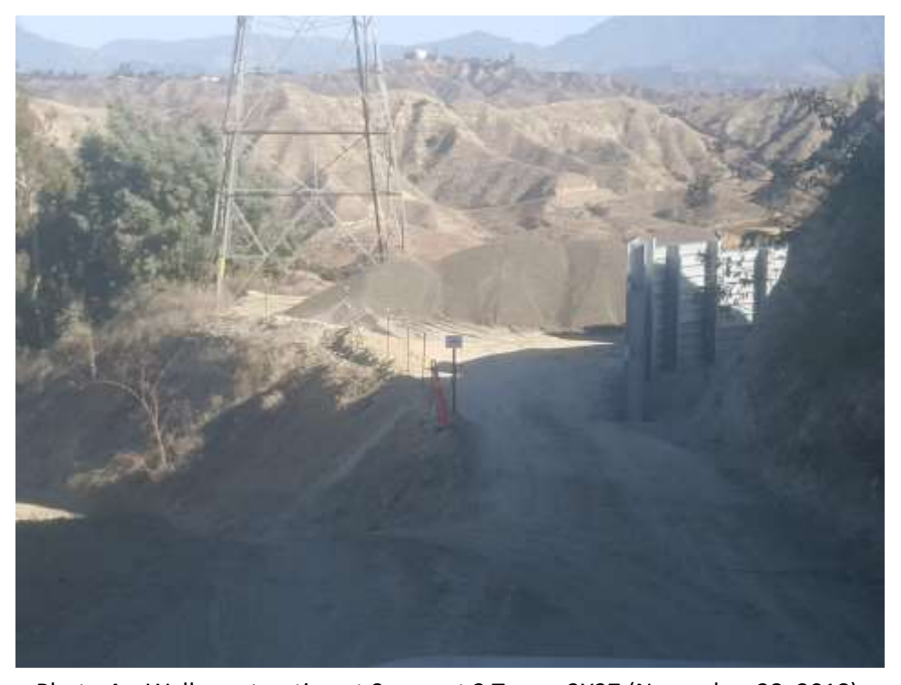
Photo 4 – Wall construction at Segment 3 Tower 3X37 (November 28, 2018).