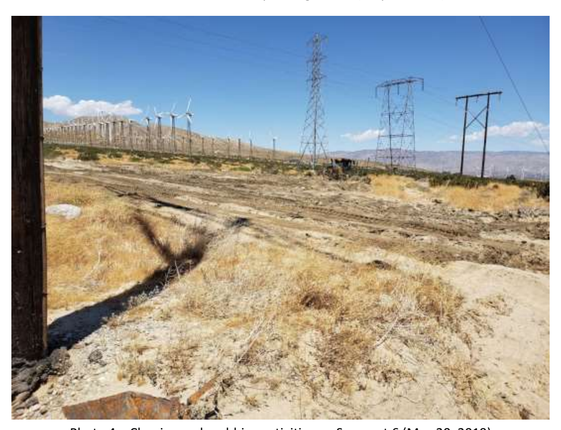
Photo 4 – Clearing and grubbing activities on Segment 6 (May 20, 2019)