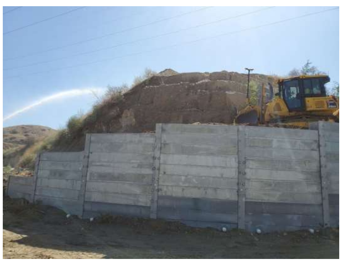
Photo 3 – Grading activities at Construction Area 3X36, Segment 3 (October 9, 2019).