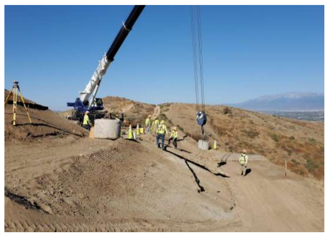
Photo 2 – Foundation activities at Construction Area 2N12, Segment 2 (October 7, 2019).