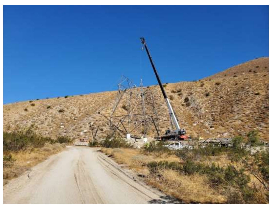
Photo 5 – Tower Assembly at Construction Area 6S31A, Segment 6 (October 8, 2019).