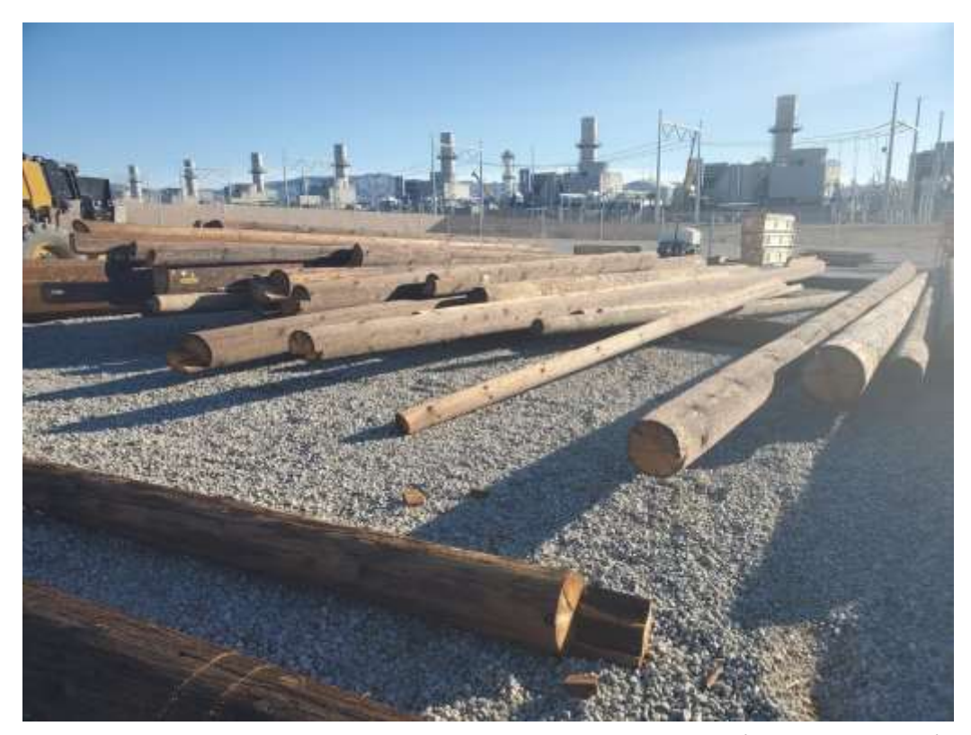
Photo 1 – Treated wood poles stored improperly at the Devers MY (October 21, 2019).