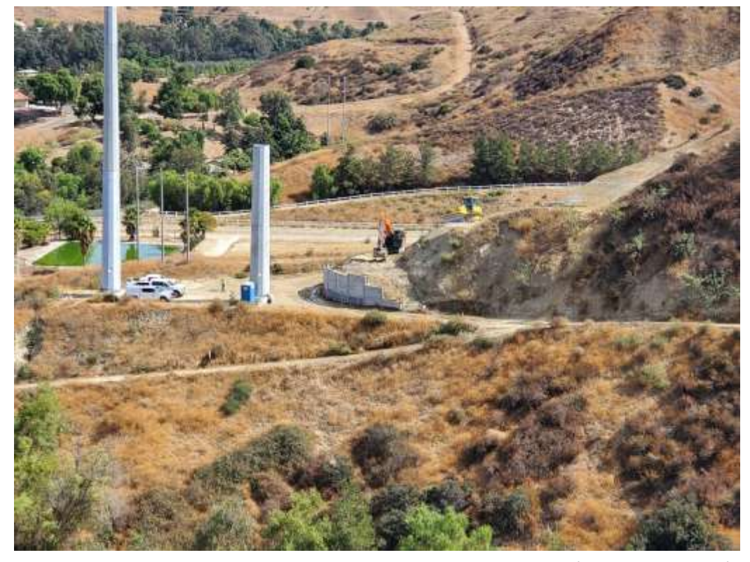
Photo 2 – Grading activities at Construction Area 3X36, Segment 3 (October 16, 2019).