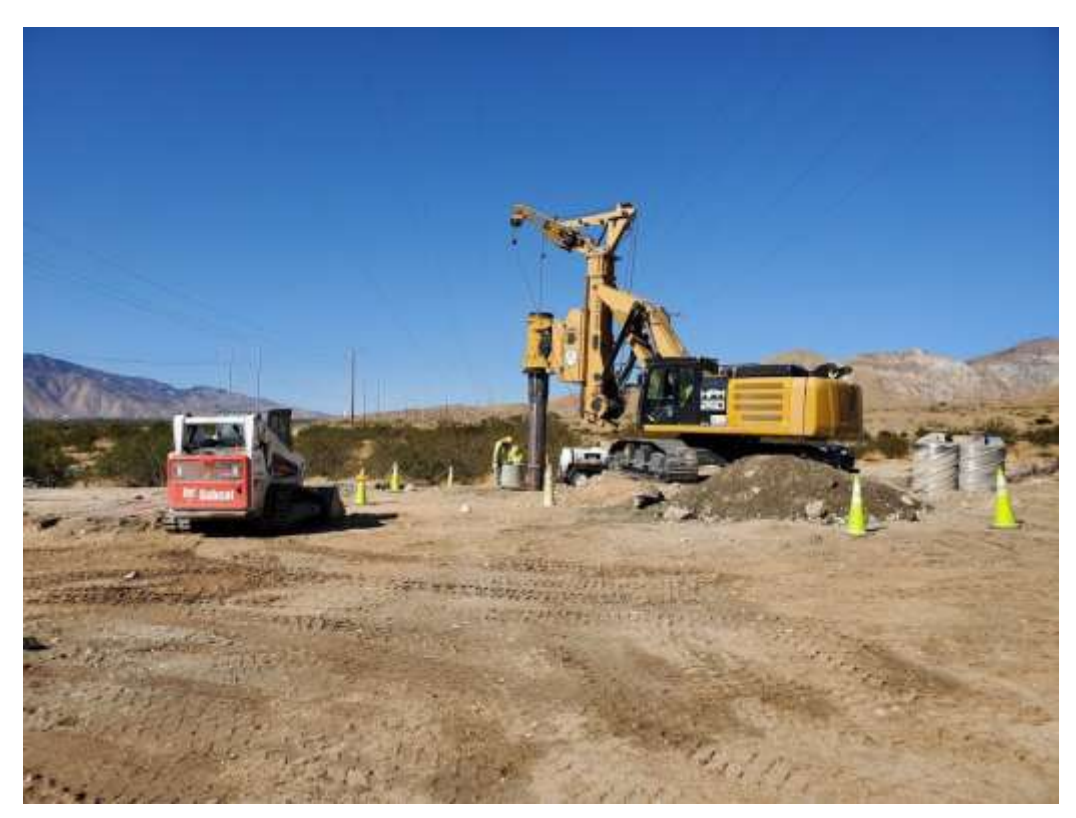
Photo 3 – Foundation activities at Construction Area 5X03, Segment 5 (October 17, 2019).