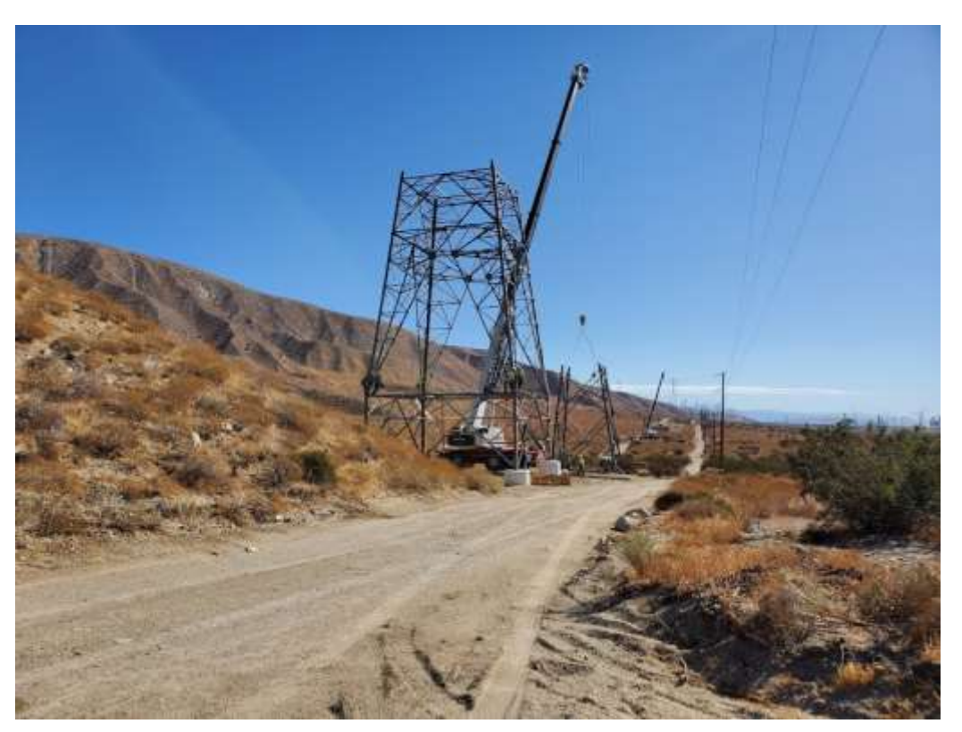
Photo 4 – Tower assembly at Construction Area 6S36, Segment 6 (October 17, 2016).