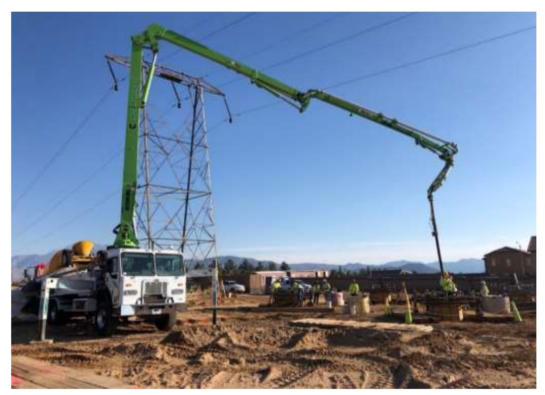
Photo 2 – Foundation activities at Construction Area 4X25, Segment 4 (November 25, 2019).