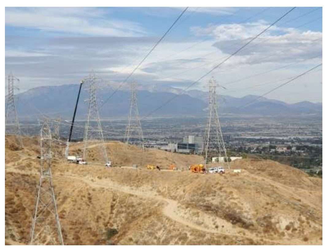
Photo 1 – Wire wreck-out activities at Construction Area 2N01, Segment 2 (November 19, 2019).