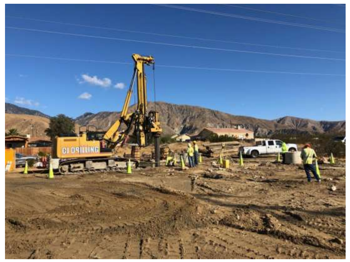
Photo 3 – Foundation activities at Construction Area 5S02, Segment 5 (November 22, 2019).