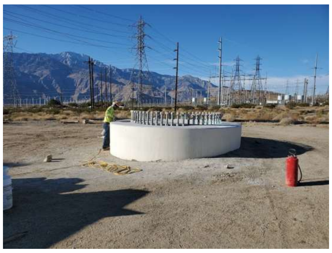
Photo 3 - Foundation activities at Construction Area 6X08 (Dec 11, 2019).