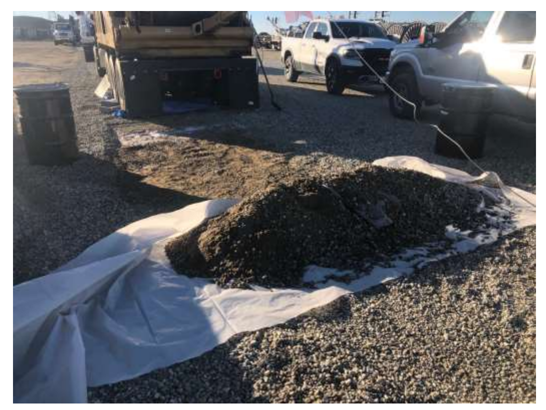
Photo 1 — Hydraulic fluid spill clean-up at the Poultry MY (February 11, 2020) (Photo courtesy of SCE).