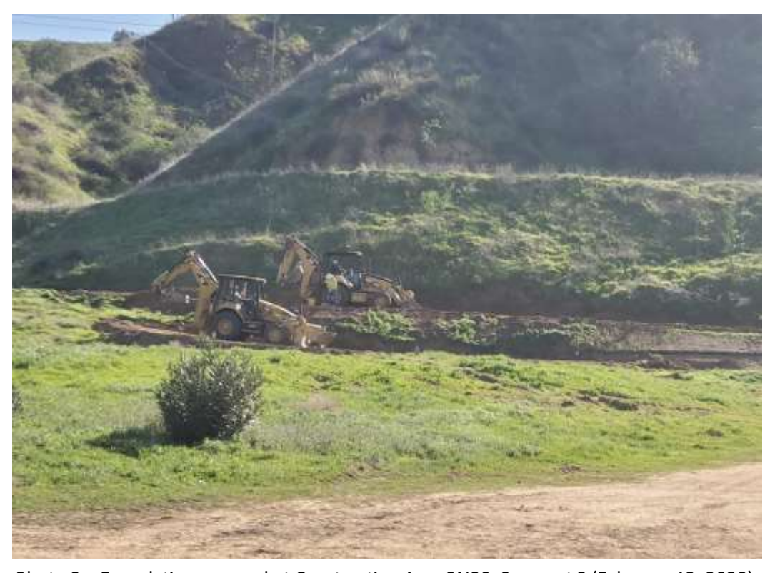
Photo 2 – Foundation removal at Construction Area 2N29, Segment 2 (February 12, 2020).