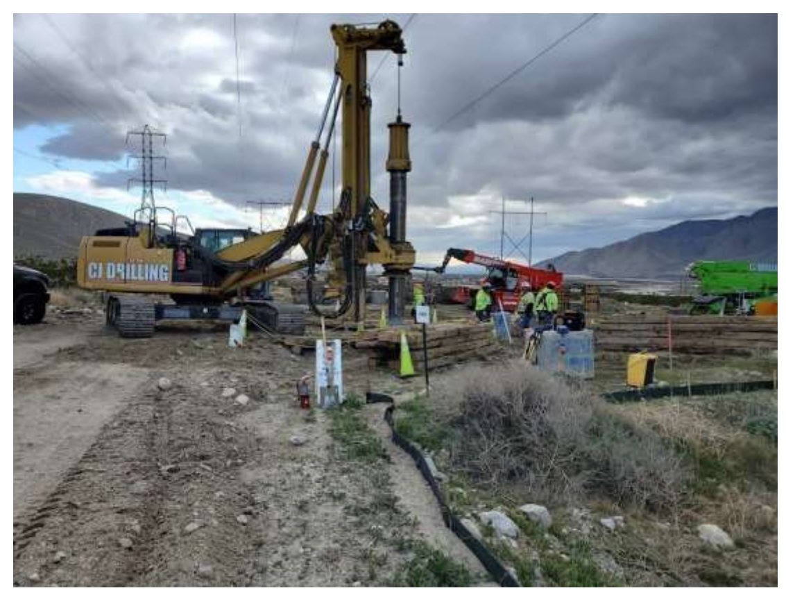
Photo 5 – Foundation activities at Construction Area 4X45, Segment 6 (February 10, 2020).