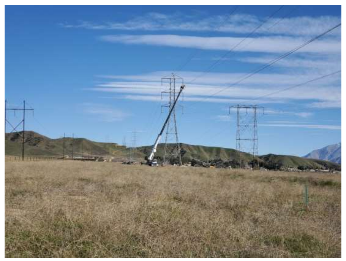
Photo 4 – Conductor wire transfer at Construction Area 4X18, Segment 4 (February 11, 2020).