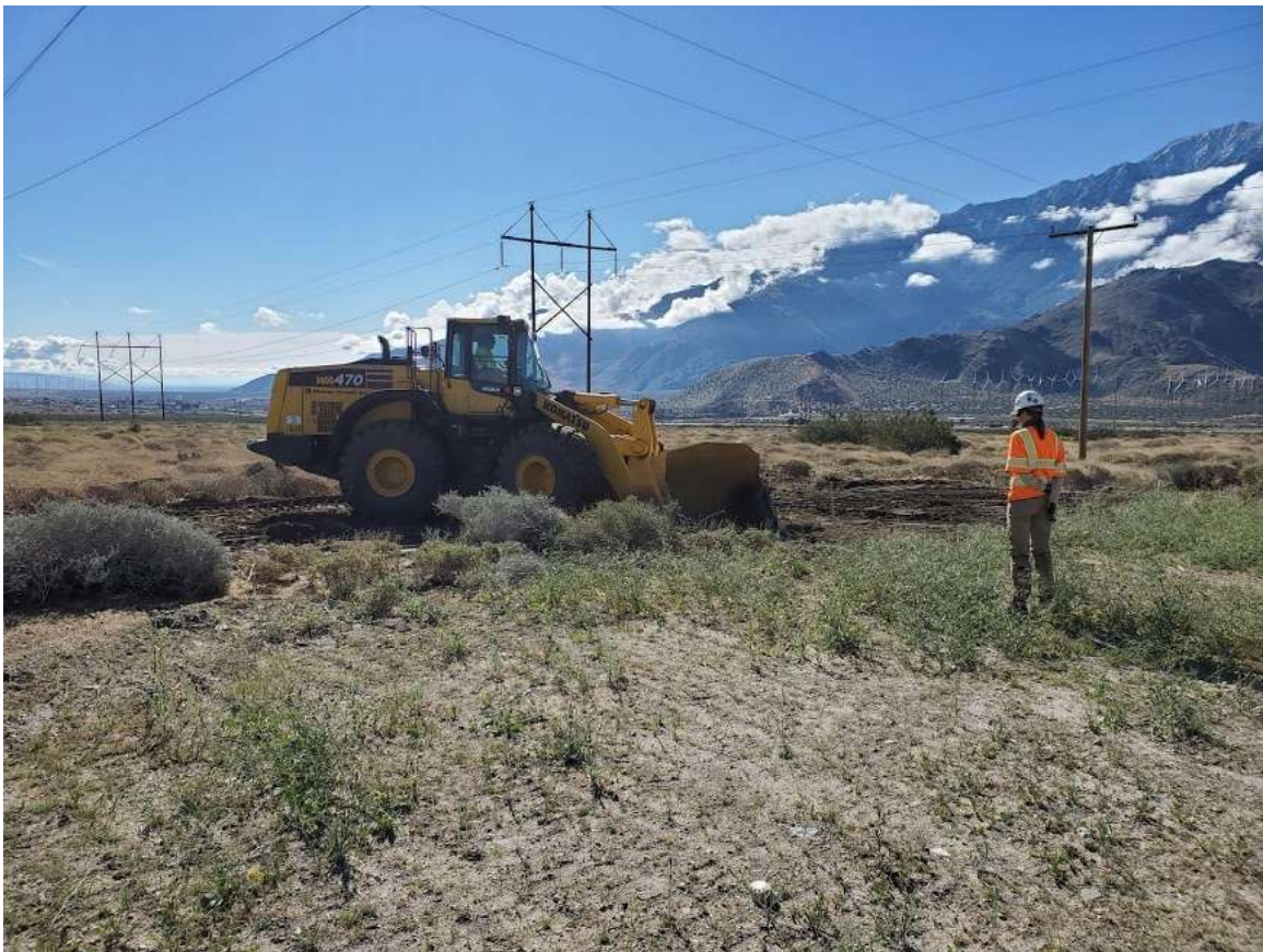
Photo 3 – Vegetation clearing at Construction Area 6X46, Segment 6 (March 11, 2020).