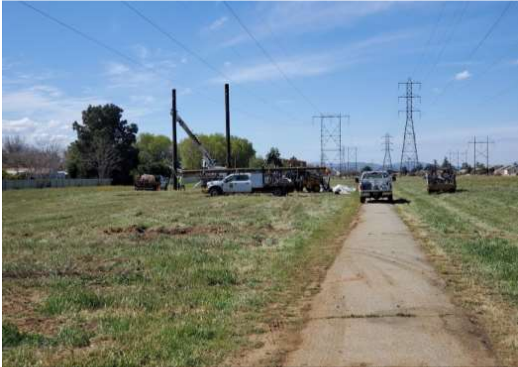
Photo 1 – Snub pole installation at Construction Area WSS4X27-4X29, Segment 4 (March 9, 2020).