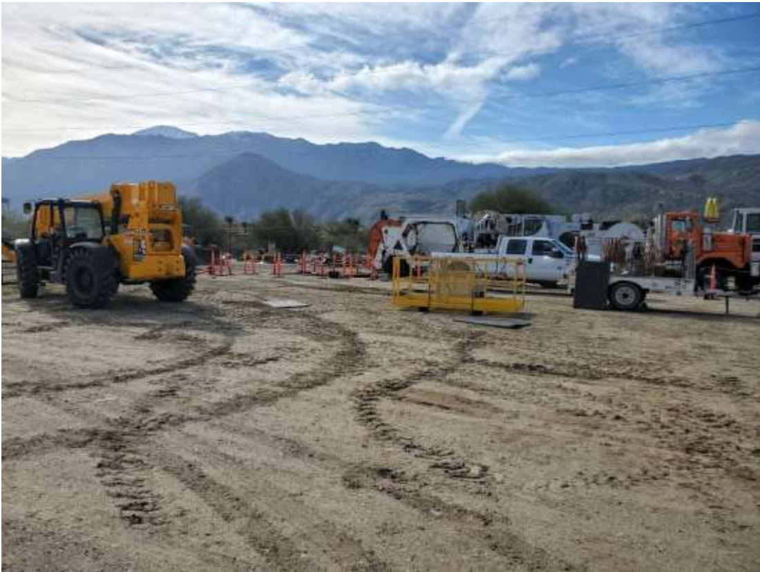
Photo 5 – Equipment and materials staged outside of approved disturbance areas between Construction Areas 5X28 and 5X29, Segment 5 (March 16, 2020).