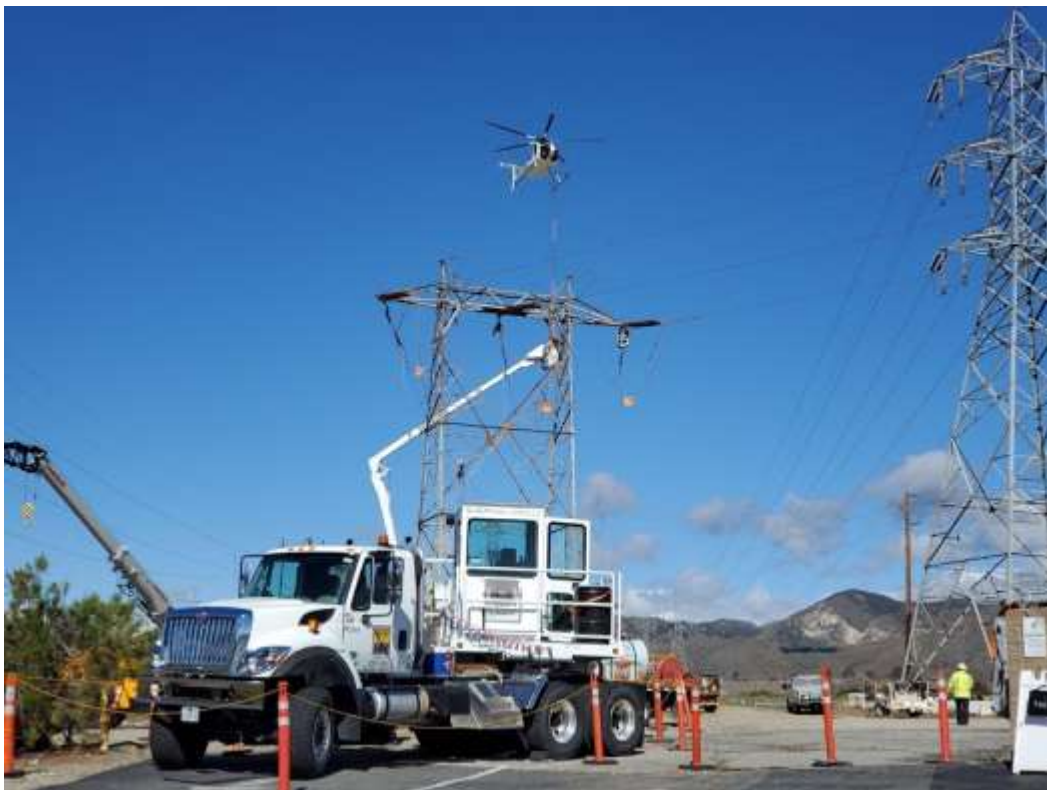
Photo 2 – Wire wreck-out activities at Construction Area 5X29, Segment 5 (March 11, 2020).