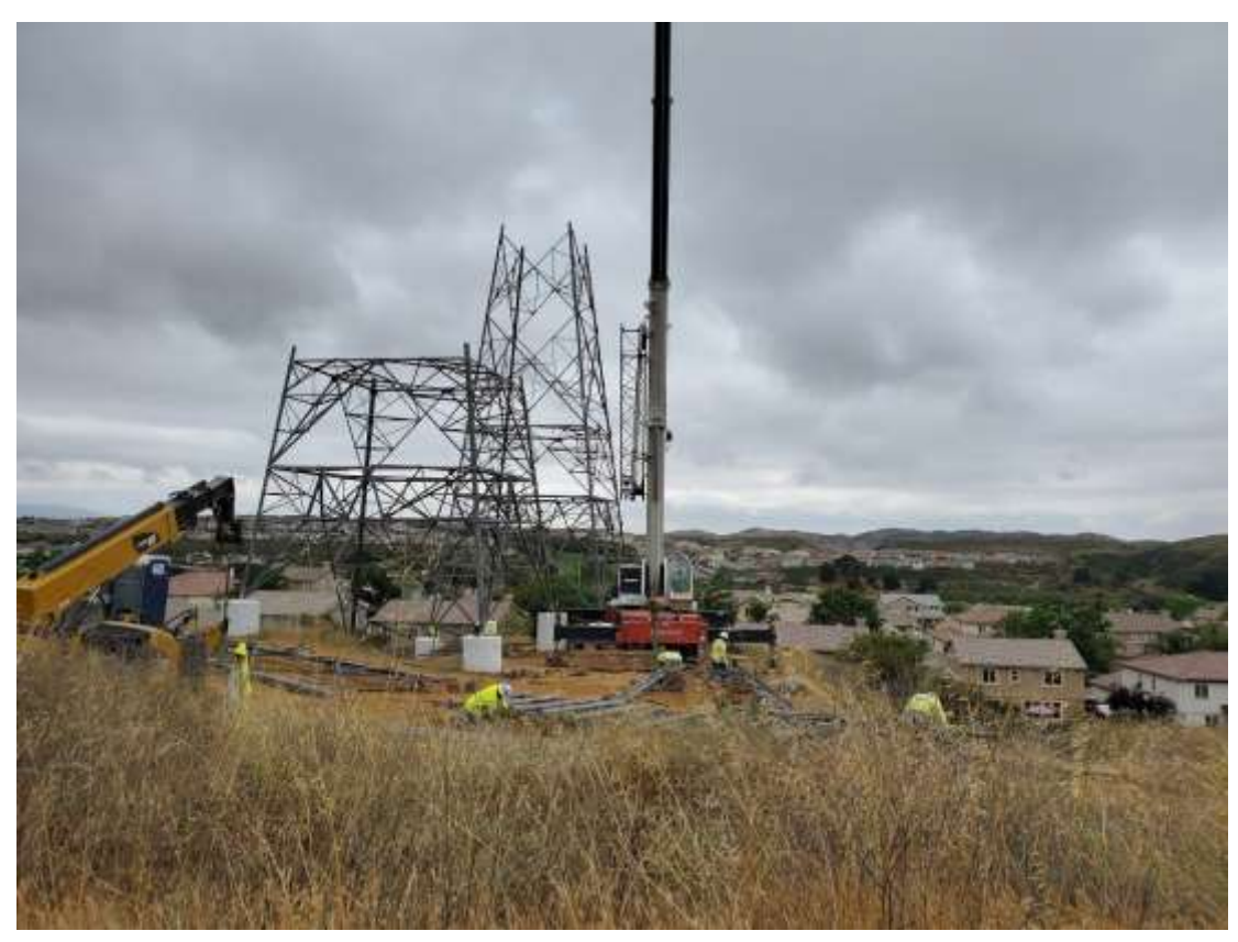
Photo 3 – Tower assembly at Construction Area 4X53, Segment 4 (June 6, 2020).