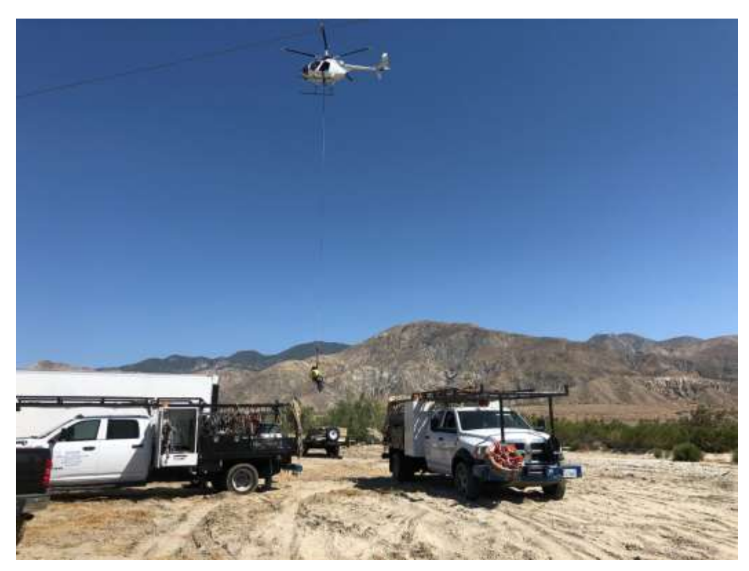
Photo 5 – Helicopter wire wreck-out activities at Construction Area 6X42, Segment 6 (June 4, 2020).