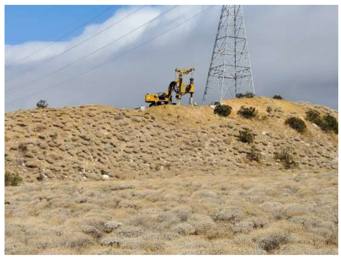
Photo 4 – Foundation activities at Construction Area 6N35, Segment 6 (June 6, 2020).