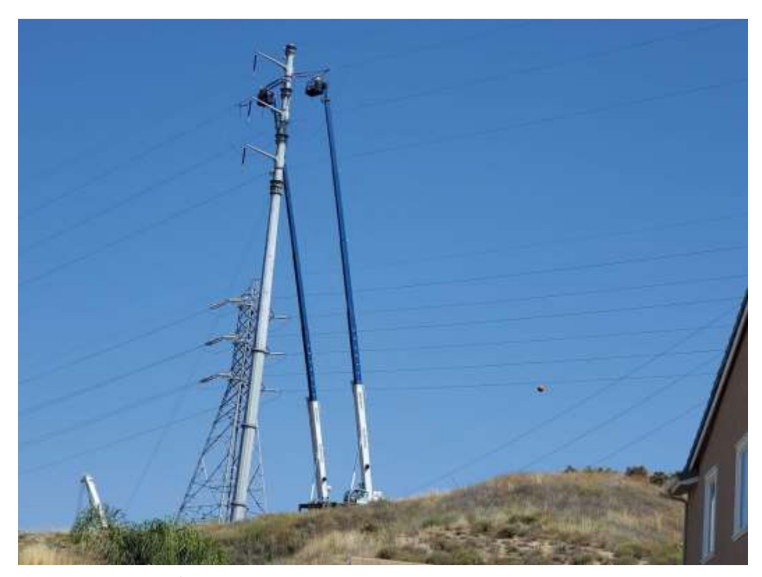
Photo 2 – Shoofly wire stringing activities at Construction Area 4X54, Segment 4 (June 3, 2020).