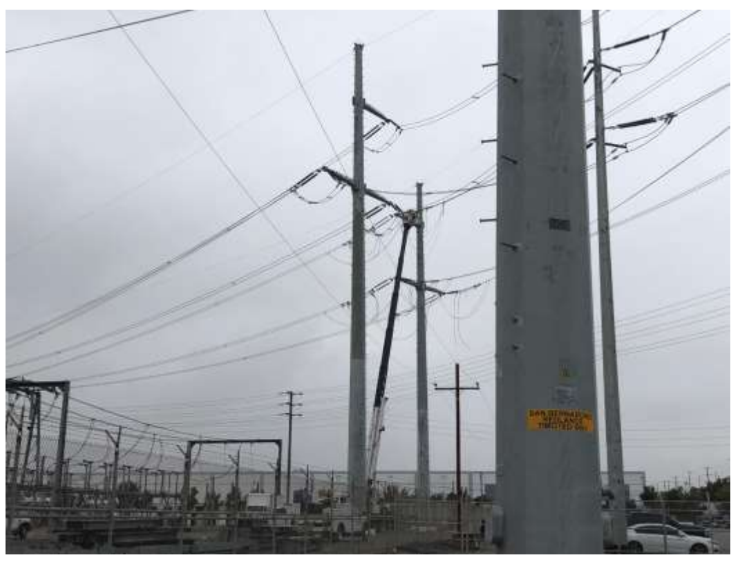
Photo 1 – Wire stringing activities within the San Bernardino Substation (June 5, 2020).