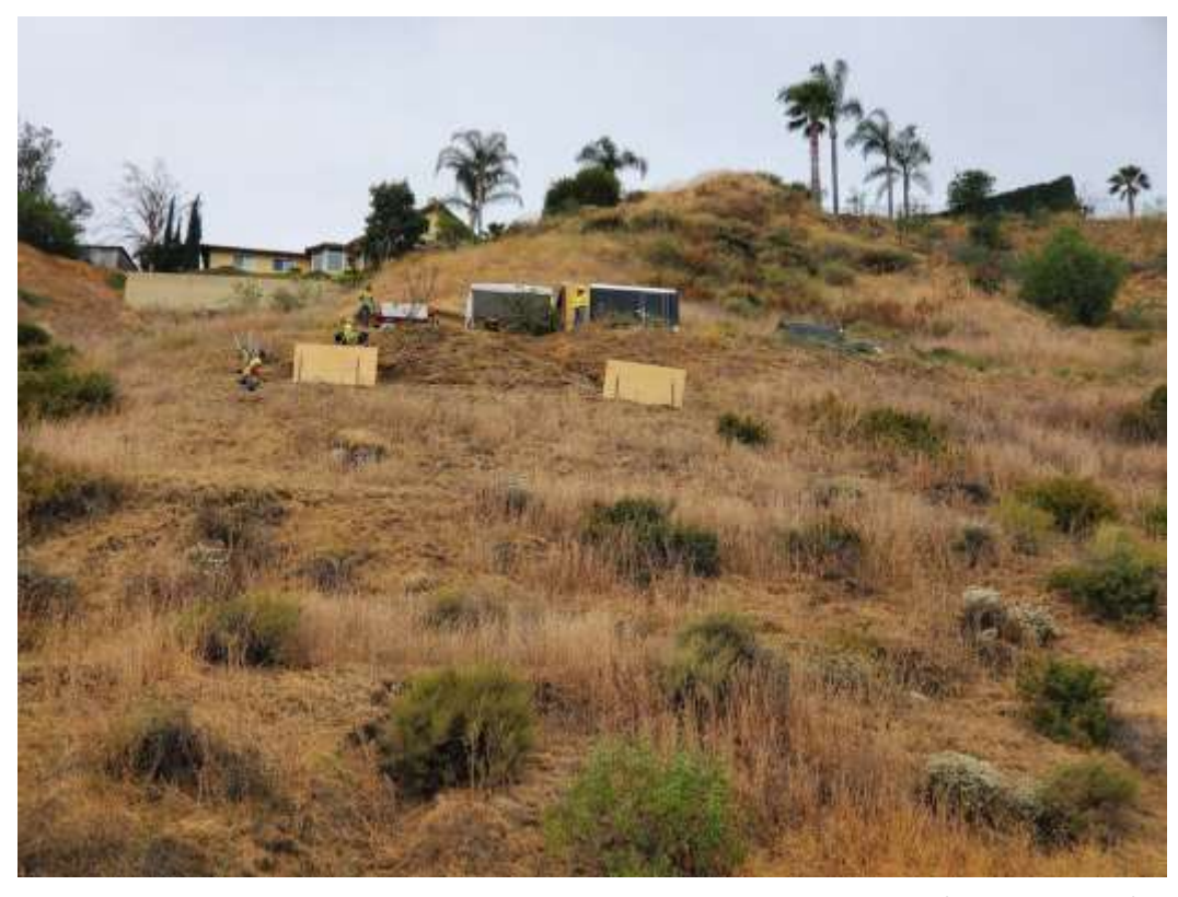
Photo 2 – Foundation removal at Construction Area 2N32, Segment 2 (June 16, 2020).