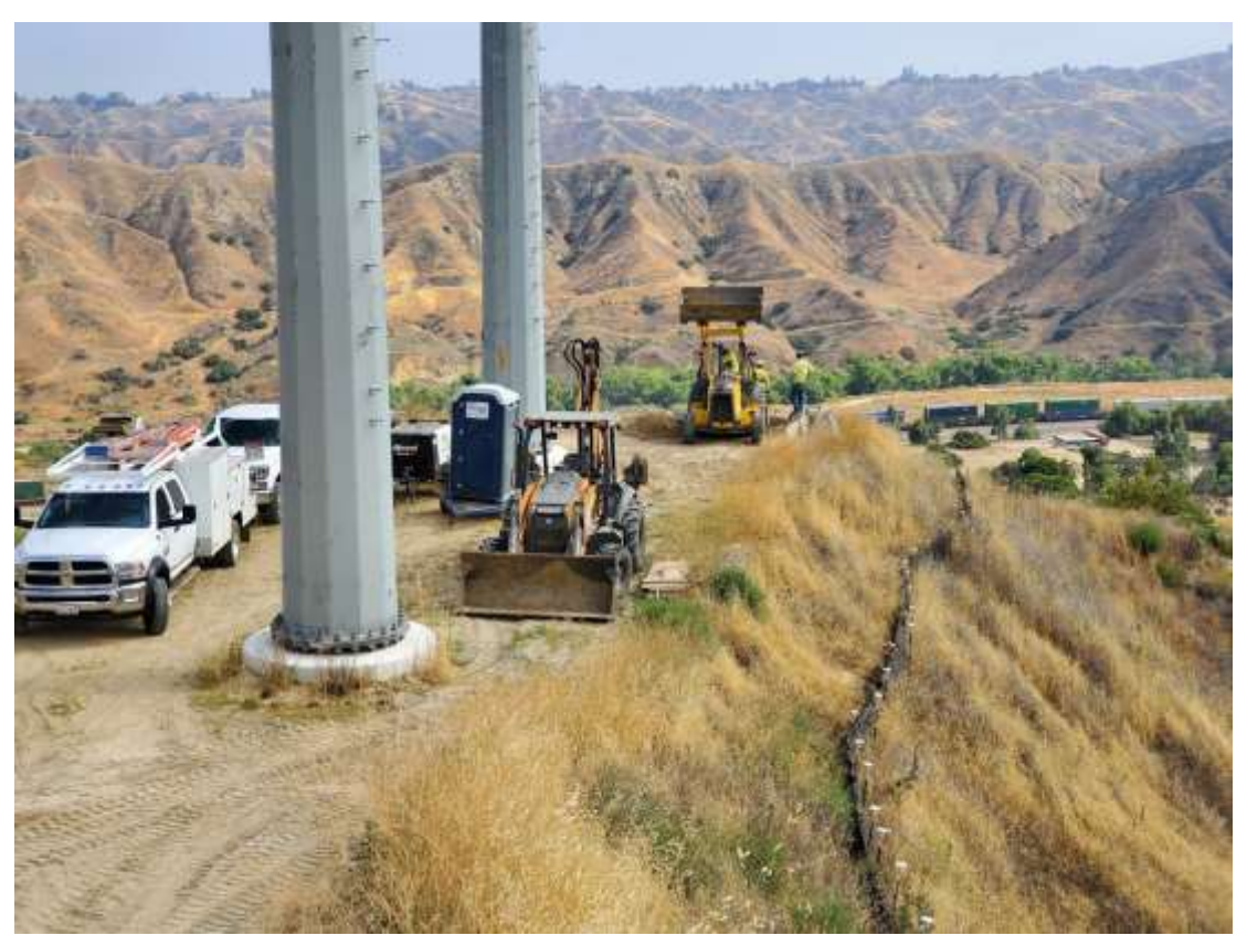
Photo 3 – MAC drain installation at Construction Area 3X35, Segment 3 (June 16, 2020).