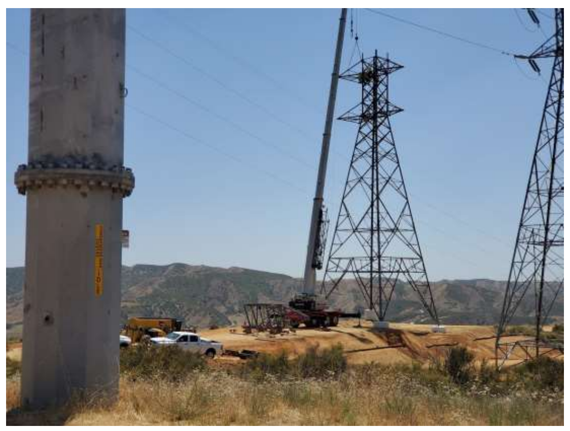
Photo 4 – Tower assembly at Construction Area 4X56, Segment 4 (June 15, 2020).