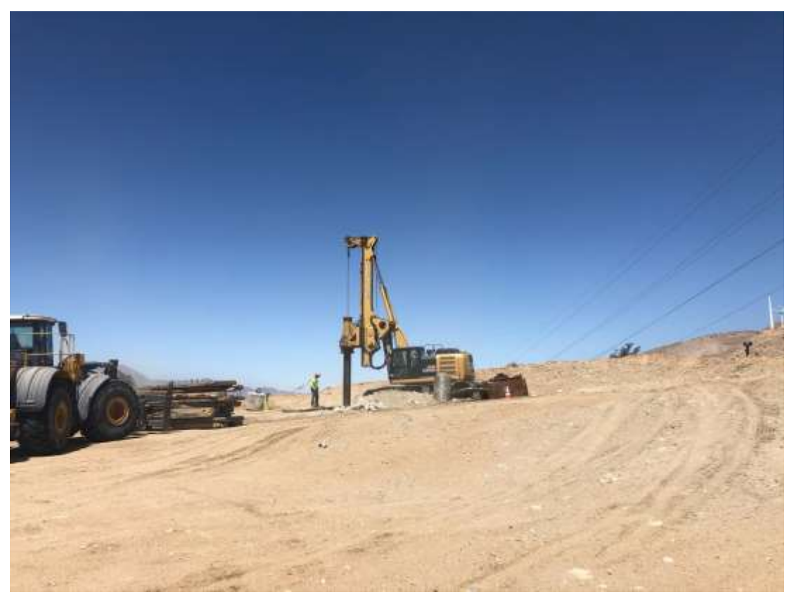
Photo 6 – Foundation activities at Construction Area 6N28, Segment 6 (June 18, 2020).