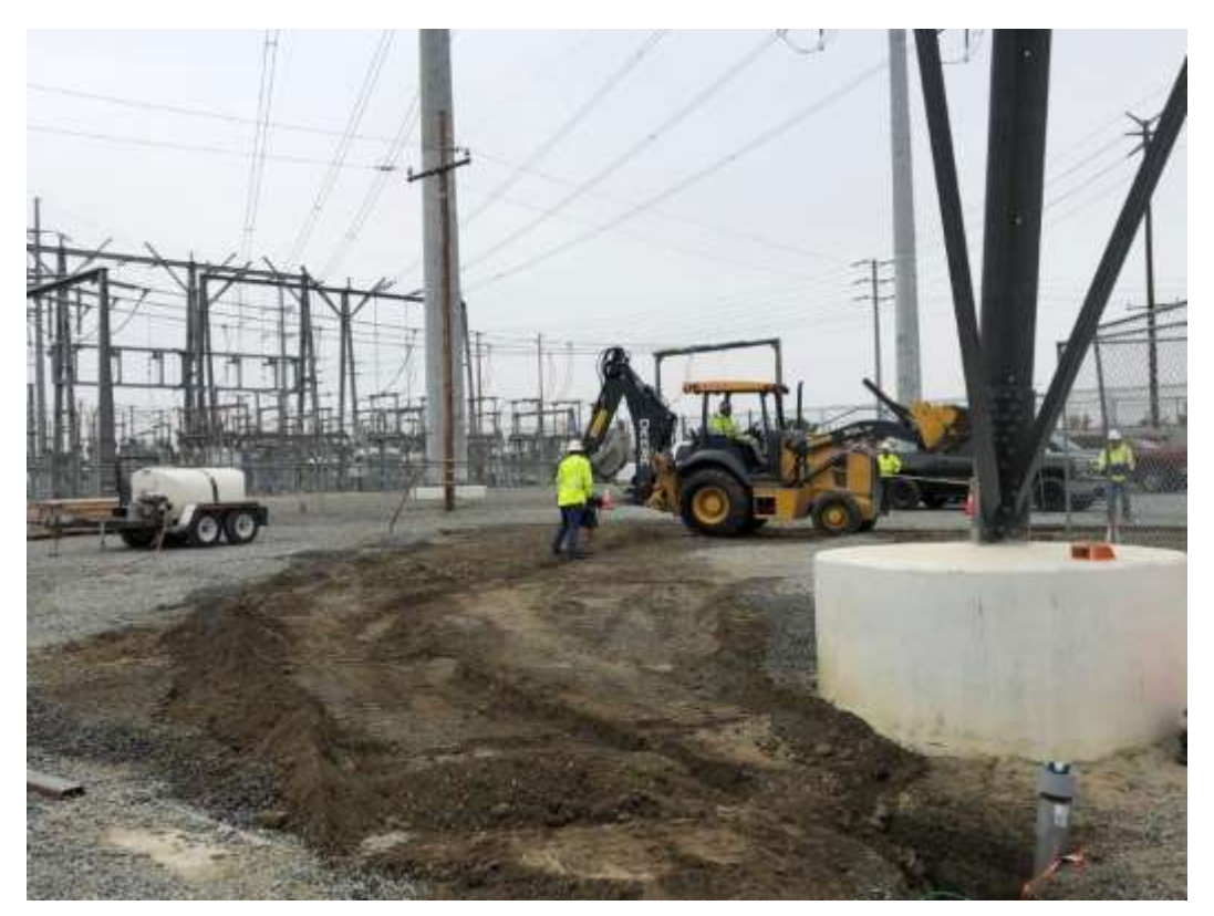
Photo 1 – Conduit installation activities at Construction Area 1X26, Segment 1 (June 19, 2020) (Photo courtesy of SCE).