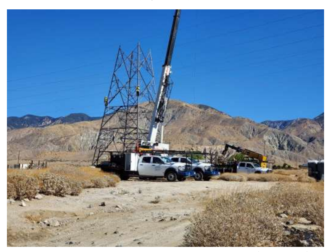
Photo 6 – Tower assembly at Construction Area 6N39, Segment 6 (July 13, 2020).