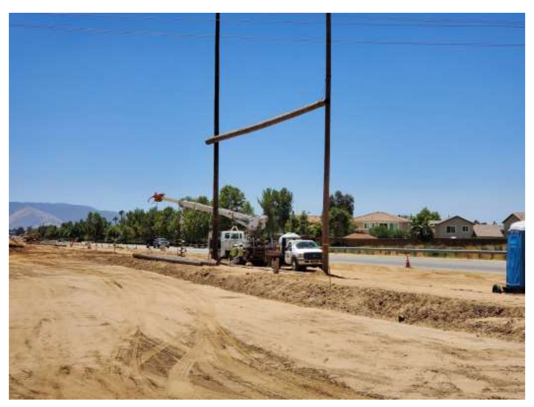
Photo 5 – Guard pole installation at Construction Area GS-4X22-4X23, Segment 4 (July 15, 2020).