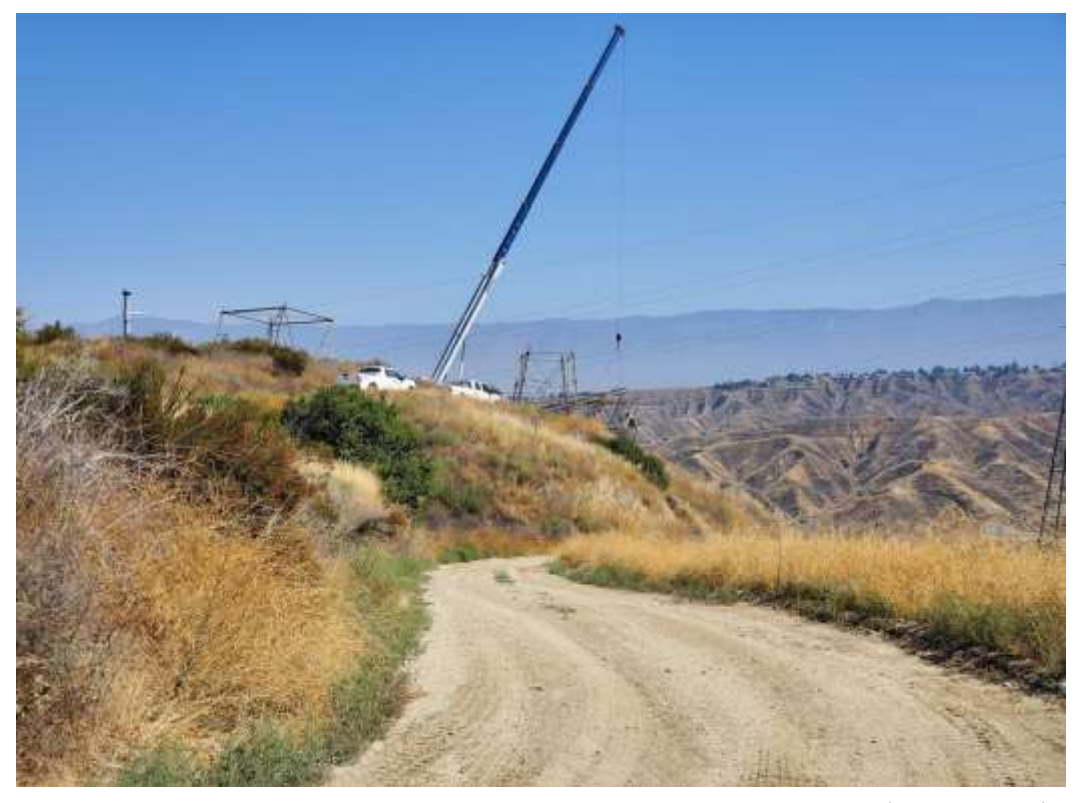
Photo 2 – Tower wreck-out activities at Construction Area 3X38, Segment 3 (July 15, 2020).