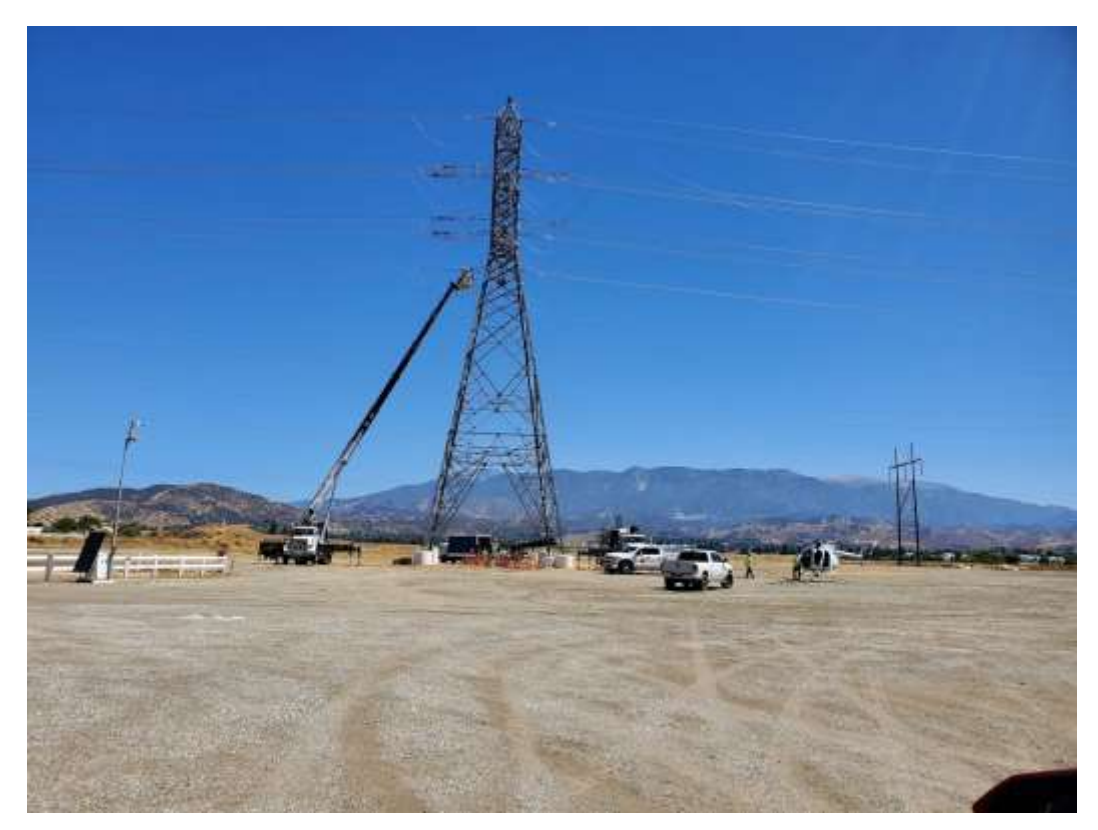
Photo 4 – Wire stringing activities and Helicopter Landing Zone at Construction Area 4X35, Segment 4 (July 15, 2020).