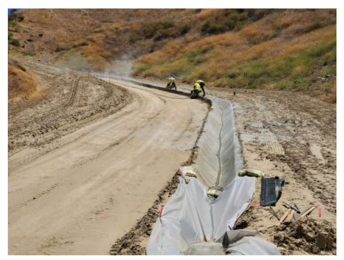
Photo 1 – V-ditch removal activities at Construction Area 2N18, Segment 2 (July 13, 2020).